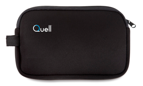
Quell Westeble Poin Relief Quick Start Guide