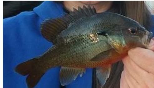
Native Redbreast Sunfish ( Lepomis auritus )

Green sunfish can outcompete a variety of native fishes due to their large mouth and predatory behavior. Native fishes, particularly either prey species or those filling the same niche, have the potential to be harmed by this species. Impacts to native sunfish species are likely the biggest concern.