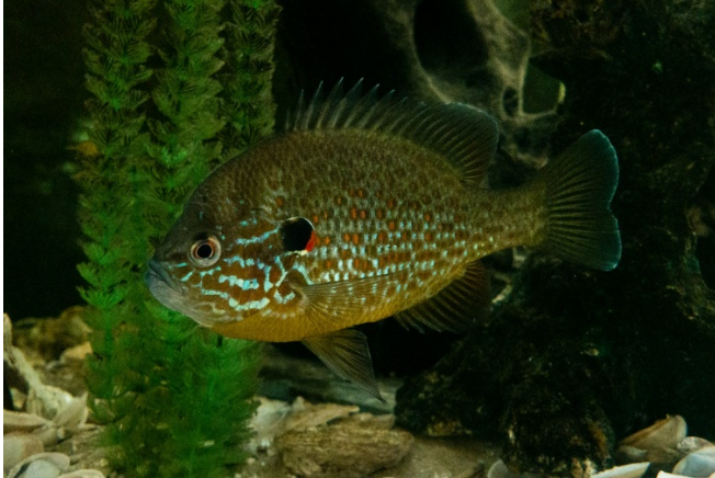
Native Pumpkinseed Sunfish ( Lepomis gibbosus )

Green sunfish can outcompete a variety of native fishes due to their large mouth and predatory behavior. Native fishes, particularly either prey species or those filling the same niche, have the potential to be harmed by this species. Impacts to native sunfish species are likely the biggest concern.