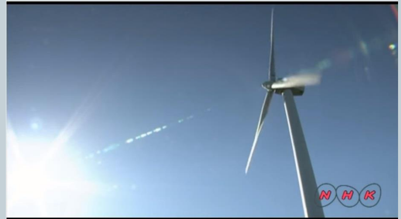
Agricultural Landscape of Southern Öland (UNESCO/NHK)

You can see wind turbines from far away.