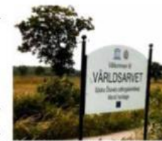
Världsarvet måste värnas anser debattörerna.

F ör 16 år sedan blev Södra Ölands odlingslandskap Sveriges tionde världsarv, vilket firades stort. När Sverige nominerade Södra Öland och accepterade Unescos världsarvskommittés beslut tog vi på oss ett långtgående ansvar: Det är inte Unesco som lovat skydda Södra Ölands odlingslandskap. Det är Sverige. Den som nominerar ger ett löfte till världen: Arvet ska bevaras och bevarandet finansieras av landet självt. Världsarv kan förändras men det som definierar värdet hos