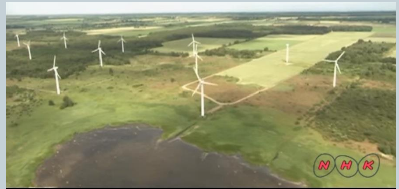
Agricultural Landscape of Southern Öland

The picture is from UNESCO's official Youtube clip from the Agricultural Landscape of Southern Öland.