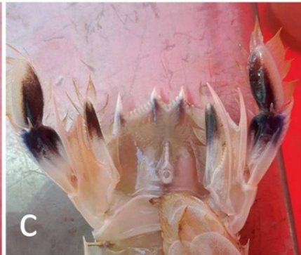
Figure 2. (a) The fresh specimen of Erugosquilla massavensis (Kossmann, 1880) from Sicily, Ionian Sea (TL 145 mm) (Detail: telson, (b) dorsal and (c) ventral view). Scale bar in (a), 5 cm.

already noted a sporadic presence of the species in the specific region (coastal waters off the city of Catania) in the two-years prior to the collection recorded in this study.