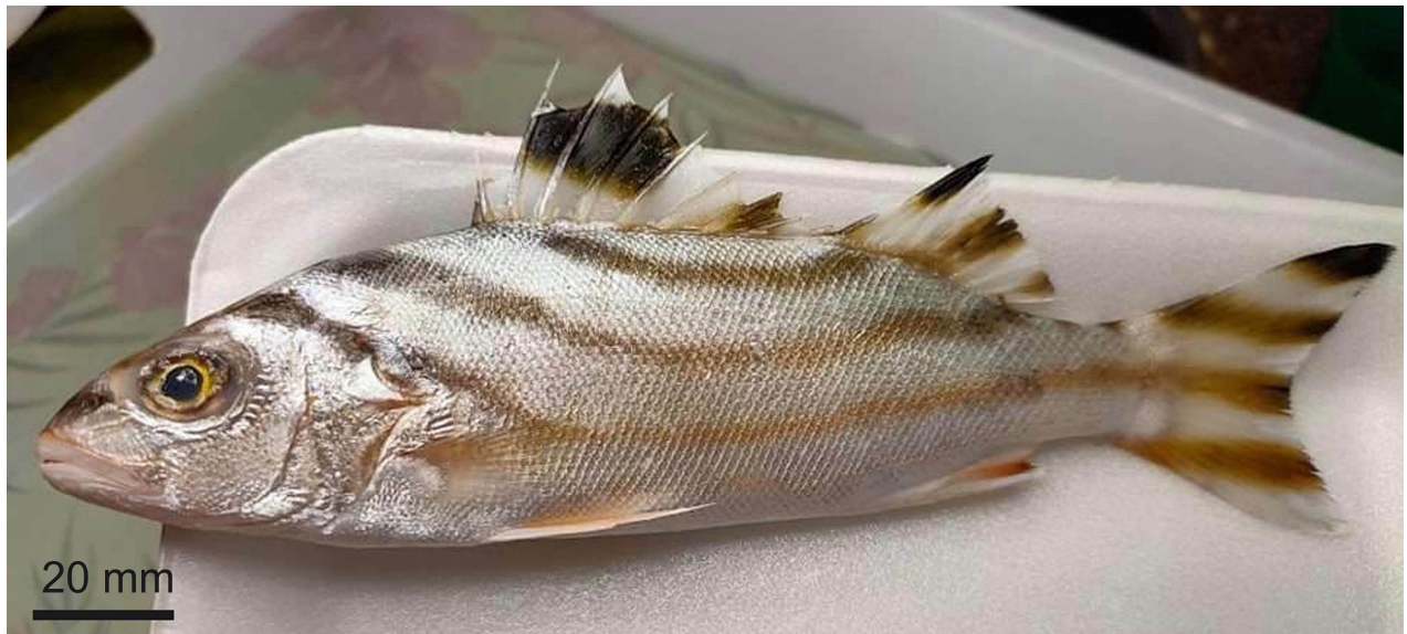
Figure 2. The specimen of Terapon jarbua captured in Abu Talat, near Alexandria, Egypt.