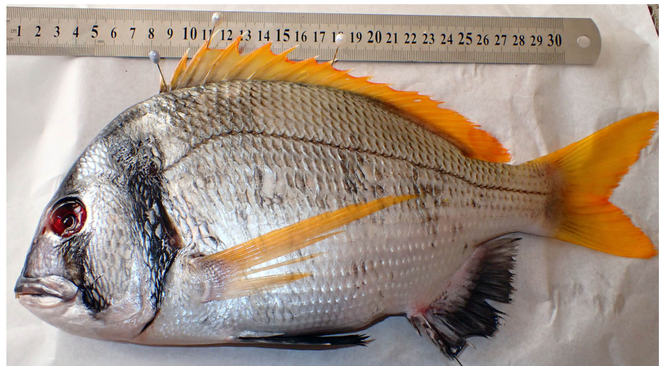
Figure 3. The specimen of Acanthopagrus bifasciatus captured in El Mamoura, Alexandria, Egypt.

There is a large black spot on the upper part of the dorsal fin between the third and sixth spines and a smaller spot lies between the eighth and ninth spines. Soft portion of dorsal fin with membranes of first 3 rays tipped with black and membranes between fifth and seventh rays entirely dark; the upper part of the last soft rays was slightly darker. Caudal fin with black stripe in the middle, hosting the extended 3 rd longitudinal stripe; two crossbands above and below it and broad black tip of the upper lobe. A black spot is located at the middle of the posterior edge of the anal fin. Pectoral and pelvic fin rays are whitish, with a transparent membrane.