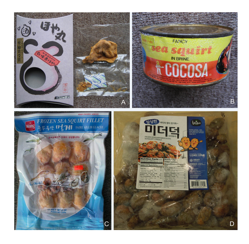
Figure 2. Processed tunicates for local consumption and export. A) Dried Halocynthia aurantium for sale in Sapporo, Japan. B) Canned Pyura chilensis from Chile. C) Imported frozen Korean Halocynthia roretzi at a Korean market in Seattle, WA. D) Frozen Styela plicata from Korea sold in the U.S.