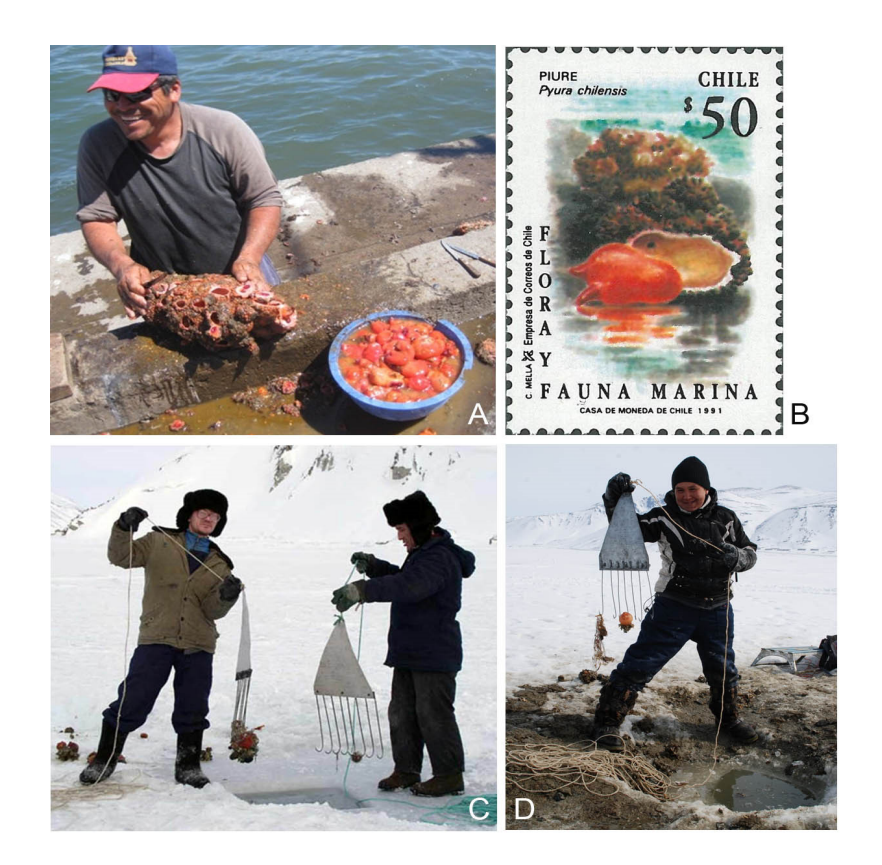
Figure 3. Harvesting edible tunicates. A: A dense clump of harvested Pyura chilensis , with the bodies removed from the tunic.