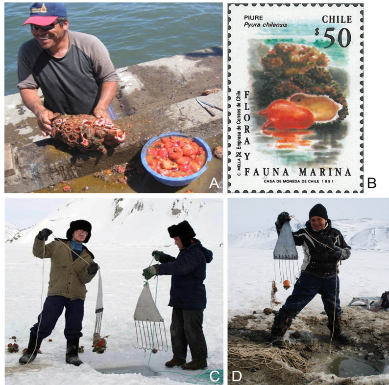
Figure 3. Harvesting edible tunicates.

A: A dense clump of harvested Pyura chilensis , with the bodies removed from the tunic.