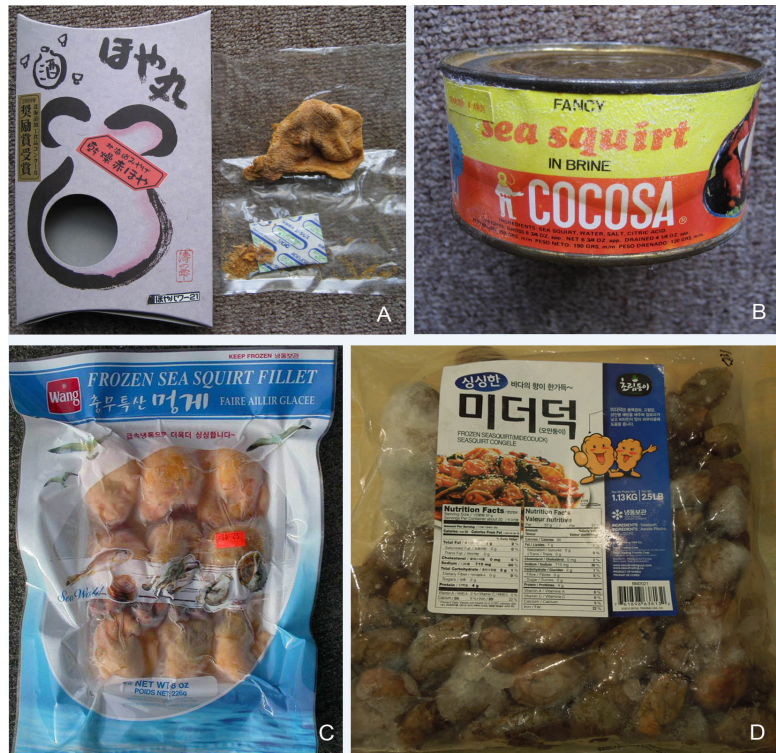
Figure 2. Processed tunicates for local consumption and export. A) Dried Halocynthia aurantium for sale in Sapporo, Japan. B) Canned Pyura chilensis from Chile. C) Imported frozen Korean Halocynthia roretzi at a Korean market in Seattle, WA. D) Frozen Styela plicata from Korea sold in the U.S.

word for sea, duh-duck ( Codonopsis sp.) is a Korean root vegetable with a similar shape. Styela plicata is consumed fresh in both Korea (Kim and Moon 1998) and the Mediterranean (Meenakshi 2009) and exported frozen (Figure 2D). Microcosmus hartmeyeri ( harutoboya in Japan) is eaten in Japan (Meenakshi 2009; Tamilselvi et al. 2010). M. sabatieri and M. vulgaris , endemic to and commercially exploited in the Mediterranean, are consumed in France, Italy and Greece (Voultsiadou et al. 2007; Tamilselvi et al. 2010; Meenakshi et al. 2012). M. sulcatus (not a valid name though still commonly used; has been synonymized under M. vulgaris ) and Polycarpa pomaria are consumed in the Mediterranean area (Meenakshi 2009). Historically, the Maoris in New Zealand consumed Pyura pachydermatina (Herdman, 1881) and the Australian P. praeputialis (long referred to as P. stolonifera (Heller, 1878) and still commonly misidentified as that S. African species (Monteiro et al. 2002)) used to be a food source by aboriginal people living around Botany Bay, Australia. Currently, other than an occasional use of P. praeputialis in alcoholic beverages in New Zealand (P. Cahill, pers. comm.), P. pachydermatina and P. praeputialis are now used mainly for fishing bait in New Zealand