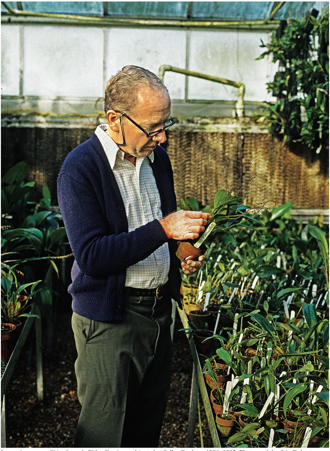
Inspecting some of his pleurothallid collection, cultivated at Selby Gardens, 1981–1982.