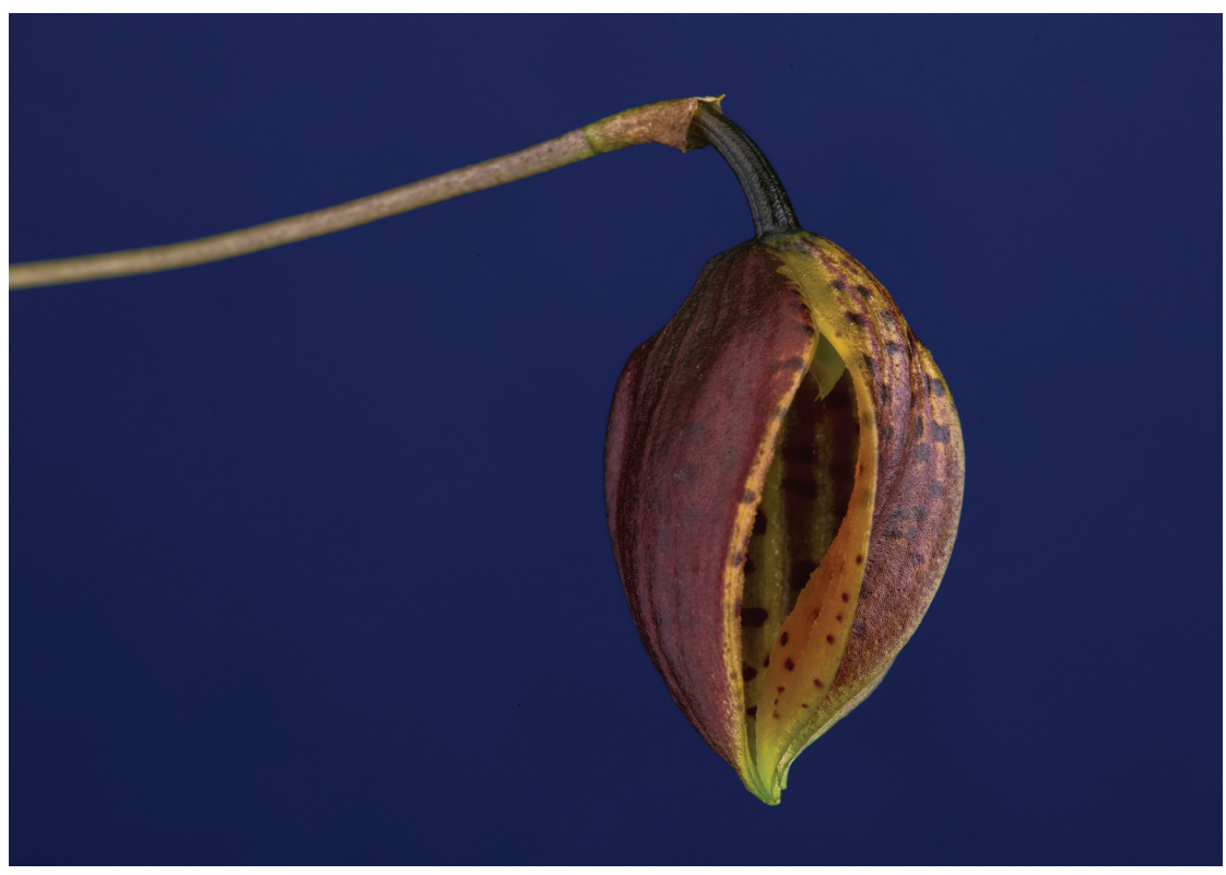
Luerela pelecaniceps, from the Lankester Botanical Garden living collection.