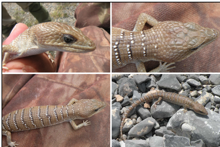
Figure 1. Specimen of Gerrhonotus lugoi from Nuevo León, Mexico.

vs. 14), longitudinal ventral scale rows (14 vs. 12), suboculars (3 vs. 2), and primary temporals (5 vs. 4) (Bryson & Graham, 2010; McCoy, 1970).