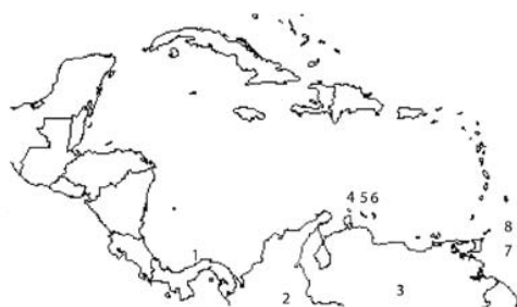
Fig. 1. Southern Caribbean countries: (1) Panama, (2) Colombia, (3) Venezuela, (4) Aruba, Netherlands Antilles islands of (5) Curaçao and (6) Bonaire, Trinidad and Tobago islands of Trinidad (7) and Tobago (8).

Fishes were obtained from fish markets after having been captured by trawl, traps, trammel nets, spearing, and hook and line. The external surfaces, mouth and gill chambers of