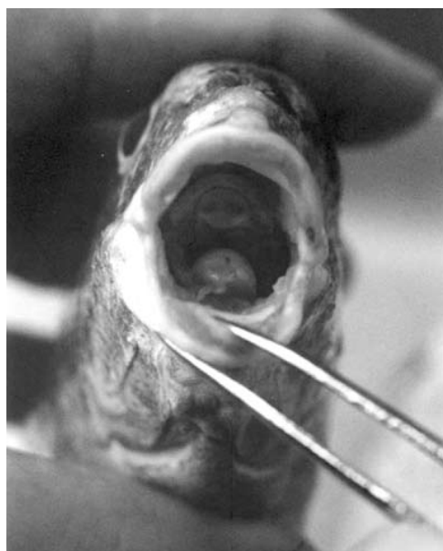
Fig. 5. Anterior view of a female Cymothoa sp. of Bowman and Diaz-Ungria attached to the tongue of a Corocoro, Orthopristis ruber (Cuvier), collected at a fish market in Carúpano, Venezuela, 12 July 1999.

Cymothoa sp. of Bowman and Diaz-Ungria (Figs. 5-6): Bowman and Diaz-Ungria