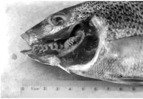
Fig. 6. Lateral view of a female Cymothoa sp. of Bowman and Diaz-Ungria attached to the tongue, and a male attached on top of the left gill rakers, of a Corocoro, Orthopristis ruber (Cuvier) collected at a fish market in Carúpano, Venezuela, 12 July 1999. Left operculum and left side of mouth were excised to expose the attachment positions.

Fig. 6. Vista lateral de una hembra de Cymothoa sp. de Bowman y Diaz-Ungria adherida a la lengua, y de un macho adherido en la parte superior de las branquias izquierdas de un Corocoro, Orthopristis ruber (Cuvier), recolectado en un mercado de Carúpano, Venezuela, 12 de julio de 1999. El opérculo izquierdo y el lado izquierdo de la boca fueron extirpados para exponer las posiciones de adhesión.