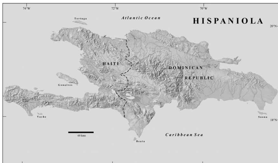
FIGURE 1. Map of the island of Hispaniola.

Hispaniola (Fig. 1) is the second largest island (76,480 km 2 ) in the archipelago of the Greater Antilles. It is centrally located in the Caribbean basin just under the Tropic of Cancer at 17°40' and 19°56' North latitude and 68°20' and 72°01' West longitude. This natural geographic unit is shared by two countries with different languages and cultures, Haiti on the western one third (27,750 km 2 ) and the Dominican Republic on the eastern two thirds (48,730 km 2 ). Hispaniola is notable for the marked physiographic variability of its terrain. Mountain systems dispersed throughout the island are the highest and most extensive of the West Indies. These have endowed this island with a great variety of ecosystems and microclimates that harbor a rich flora and fauna with significant numbers of endemic species.