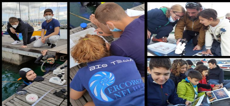
Figure 1. Students and citizens involved in the monitoring program (Pictures by Erika Mioni).

MATERIALS & METHODS – Marinas of Fezzano, Portovenere, Santa Teresa and Lerici were chosen as monitoring stations for the Citizen Science activities. Monitoring surveys were realized along linear transects, by visual census , involving the participants lying and leaning out of the edge of pontoon, whereas sampling was realized through snorkelling. In accordance with a check list of species and illustrated guides, some data such as abundance and habitat information were collected, together with in situ and/or microscopic pictures. Activities were carried out before and after the lockdown, in compliance with Covid-19 regulation.