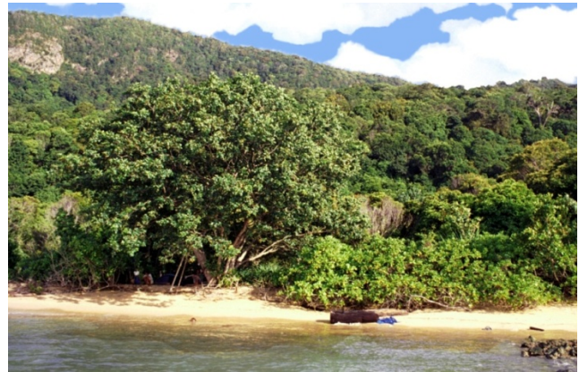
Figure 1. Coastal forest of Legon Moto in the Karimunjawa Island, Java Sea, Indonesia which discovery habitat of C. melanota

The study was conducted between April and May 2004 on the coastal forest of Legon Moto in the eastern corner of the Karimunjawa Island. The topography comprises of hilly forests with an altitude of 0 – 300 meters above sea level. The forest is an uninhabited area which can only be reached by sea travel. The vegetation of Legon Moto is dominated by mangrove fan palms ( Licuala spinosa ), leguminous trees (Caesalpiniaceae), woody climbing shrubs (Annonaceae), euphorbias and evergreen shrubs or small trees ( Aglaia spp.) (Figure 1).