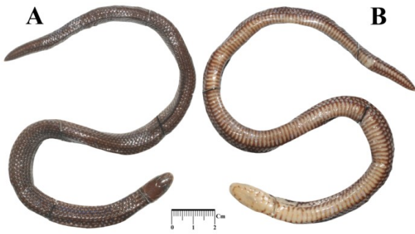
Figure 3. The upper side (A) and under side (B) body of C. melanota (MZB.Ophi.3129) from the Karimunjawa Island, north of Java, Indonesia. The first three scale rows and ventral scales show the characteristics of this species (Photographs by Irvan Sidik).