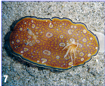
Figure 2. Chelidonura livida Yonow, 1994 50 mm