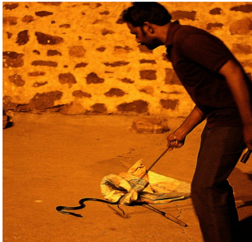
(C) Preparing for rehabilitation after rescue- Spectacled Cobra