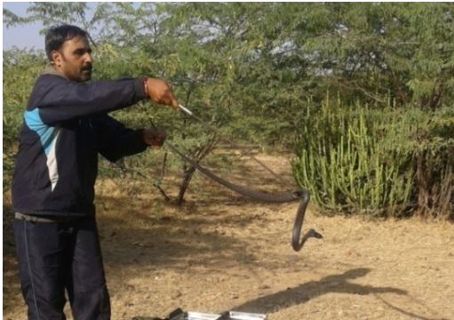
(B) Rescue operation- Spectacled Cobra