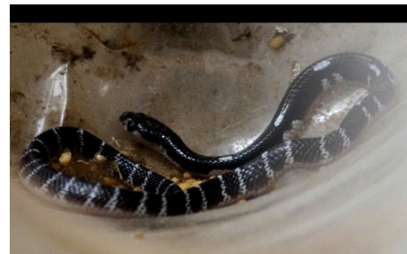
Fig. 10. Bungarus caeruleus , the Common Krait

Pseudoboia caerulea Schneider, 1801. Hist. Amphib. , 2: 284 (type-locality: Vizagapatam, Andhra Pradesh, India; India orientali according Bauer, 1998).