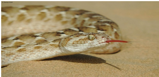
Fig. 14. Echis carinatus sochureki , the Sochurek's Saw-scaled Viper

Diagnostic Features: Stocky-bodied, tail very short and abruptly tapering, head short, wider than neck, pupil of eye vertical.