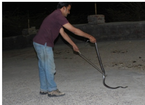
(A) Rescue operation, Black-headed Royal Snake, black morph

2. Methodology: At first on locating the snake, it is hooked by the expert and then tactfully transferred in the bag for rehabilitation to wild, their safe, fieldom (A-D).