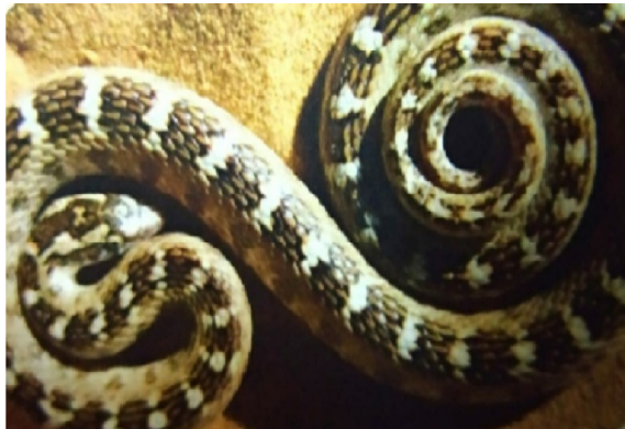
Fig. 5. Lytorhynchus paradoxus , the Long-nose Sand Snake.

Colouration: Body (slightly triangular in cross section) with H or X-shaped black spots throughout on grey or pale brown dorsal surface separated by white, sides with smaller spots alternating with dorsal spots, belly whitish and without any spots, upper lip white, a thick streak behind eyes and a short one below it, dorsum of head greyish-brown with large dark brown covering.