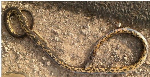
Fig. 9. Spalerosophis atriceps , the Black-headed Royal Snake

Zamenis diadema var. atriceps Fischer, 1885. Jahrb. Hamburg. Wiss. Anst. , 2: 82-121 (type-locality: Himalaya).