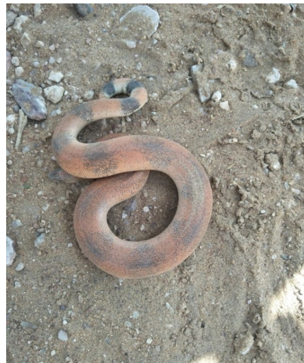
Fig. 1. Eryx johnii , the Brown Sand Boa

Diagnostic Features: Cylindrical and thick bodied, head wedge-shaped, not distinct with mental groove, eyes small with 6 vertical pupil, tail blunt, rounded, not distinct from rest of body.