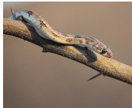
Fig. 6. Platyceps ventromaculatus , the Glossy-bellied Racer

Colouration: Dorsal ground colour greyish-white, pale-sandy, yellowish-olive, brownish-grey or reddish-white with up to at least 74 transverse blotches throughout on main body and a lateral series of spots or oblong bars usually alternating with median markings, tail without pattern and often lighter than body, sometimes a distinct yellowish band (interrupted by somewhat broader blackish spots) or dark line along centre of back; ventral side yellow or ivory with pearly iridescence and lateral sides may be irregularly spotted with black dots; fronto-parietal region with a black transverse bar, a dark spot below eye and an oblique stripe on temple, usually with a short dark nuchal streak or a broad transverse collar.