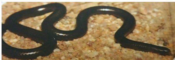
Fig. 13. Indotyphlops braminus , the Brahminy Worm Snake

Eryx braminus Daudin, 1803. Hist. Nat. Rept. , 7: 279 (type-locality: Vizagapatnam, India).