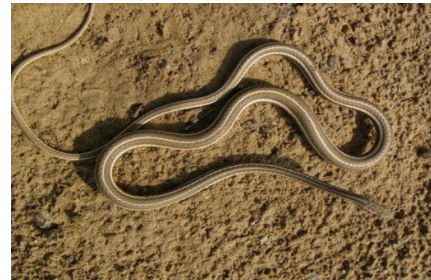
Fig. 12. Psammophis schokari , the Schokari Sand Snake

Coluber schokari Forskal, 1775. Descriptiones animalium, avium, amphibiorum, piscium, insectorum, vermium; quae in itinere Orientali observavit Petrus Forskal . Moller, Haunia: xxxiv + 164 (type-locality: Hodeida, Yemen).