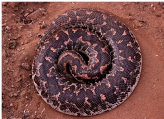
Fig. 2. Gongylophis conicus , the Common Sand Boa

[Boa] Conica Schneider, 1801. Historiae Amphibiorum naturalis et literariae. Fasciculus secundus continens Crocodilos, Scincos, Chamaesauras, Boas. Pseudoboas, Elapes, Angues. Amphibaenas et Caecilias . Frommanni, Jena: 268 (type-locality: India oriental= Tranquebar vide Bauer, 1998).