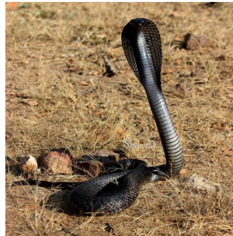
Fig. 11. Naja naja , the Spectacled Cobra

Scalation: Dorsal scales smooth, glossy and strongly oblique. Mid-body scales in 23 rows (21-25), ventrals 171-197; anal shield single; subcaudals 48-75, divided; upper labials (3 rd largest and touching nasal anteriorly, 3 rd and 4 th touching eye), lower labials 9-10 (smaller angular cuneate scale present between 4 th and 5 th lower labial); preocular one in contact with internasals; postoculars 3; temporal 2+3.