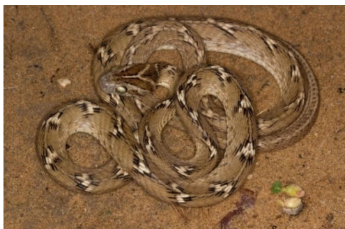
Fig. 3. Boiga trigonata trigonata , the Common Cat Snake

Coluber trigonatus Schneider in Beschtein, 1802. Bechst. transl. Lacep. , 4: 256, pl. 40, Fig. 1 (type-locality: Visakhapatnam vide) [17].