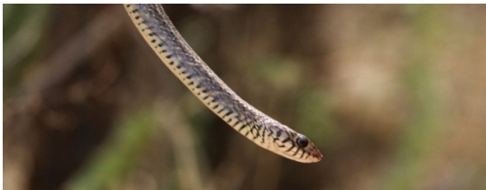
Fig. 7. Ptyas mucosa , the Indian Rat Snake

Vernacular Name: Bairokh (Assamese), Dharaj , Darash (Bengali), Dhaman , Ghora-pachhar (Hindi); Jerothana (Kannada), Deevod (Konkani), Chera , Manja-chera (Malayalam), Dhaaman (Marathi), Dhaman (Nepali), Dhamanaa Sanp (Odiya), Saarai-pambu (Tamil), Jerri-goddu (Telugu).