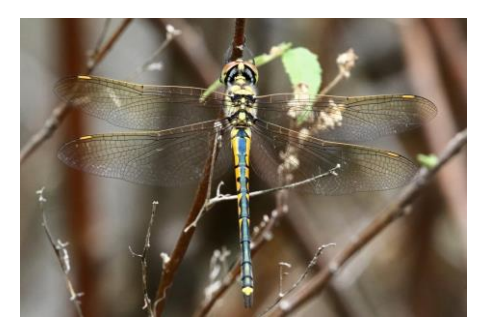
Tau Emerald Dragonfly