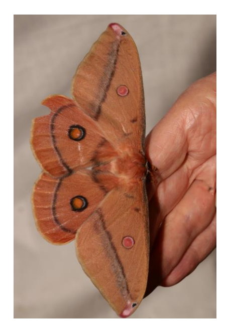
Opodiphthera helena (Emperor Gum Moth)