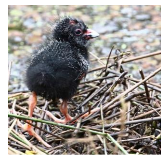
Australian/Purple Swamphen chick