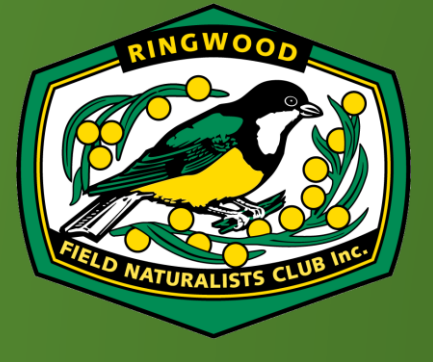
Issue No. 46 – April 2018