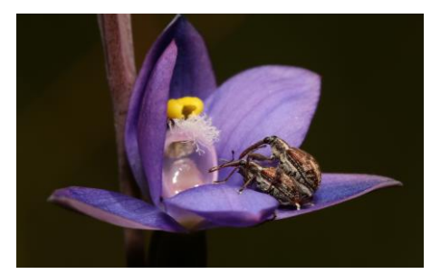
Thelymitra species with Weevils