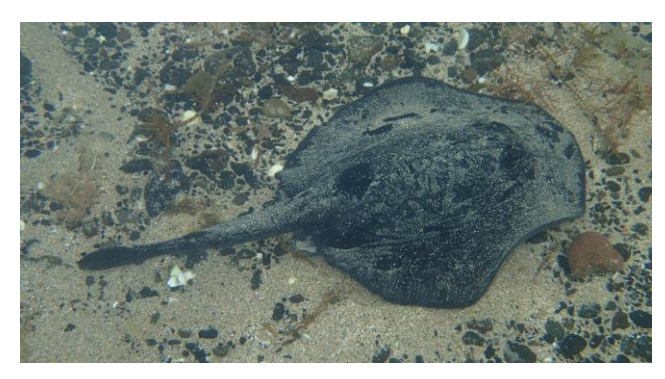
A juvenile stingaree

Some of the other (underwater) inhabitants of Mushroom Reef