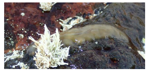
Notoplana australis (Flatworm)