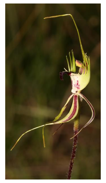
Caladenia tentaculata (Mantis Orchid)