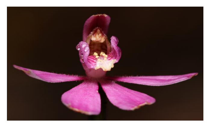
Caladenia carnea (Pink Fingers)