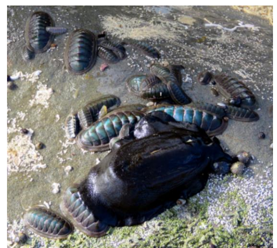
Chitons and Elephant Snails on upturned rock

The camp was concluded with dinner at the local pub followed by a get-together and birdcall back at the Cottage, where highlights of the weekend were discussed. The final tally for bird species seen came to a magnificent 81. It was unanimously agreed that it had been a most successful and enjoyable camp-out.