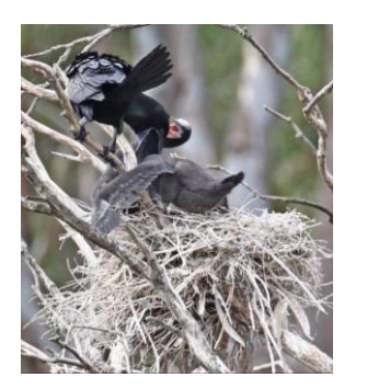
Some of the nesting waterbirds Little Black Cormorant (left) & Australasian Darter (right)

As we walked round the lake, Australian White Ibis were to be seen nesting everywhere, but among them were to be found nesting Australasian Darters, Little Black and Little Pied Cormorants. Two Royal Spoonbills were seen in a treetop, but we were unable to make out whether they had a nest there or not.