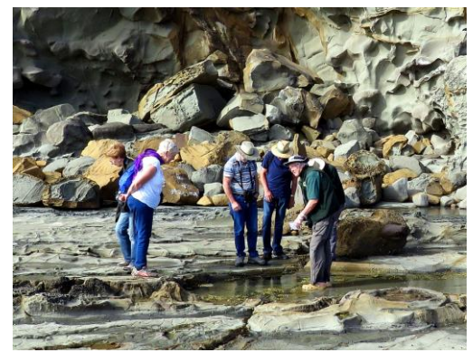
Exploring the Kilcunda rock platform

On Friday afternoon, a walk was taken from the Retreat across Kilcunda's famous trestle bridge, then returning via the beach. The cliffs and rock platforms provided much geological interest and the numerous rock pools contained a diversity of marine life, including anemones, chitons and elephant snails. In the evening, a meeting was held at the leaders' accommodation, "the Cottage", at which the Club's new projector was demonstrated to much acclaim.