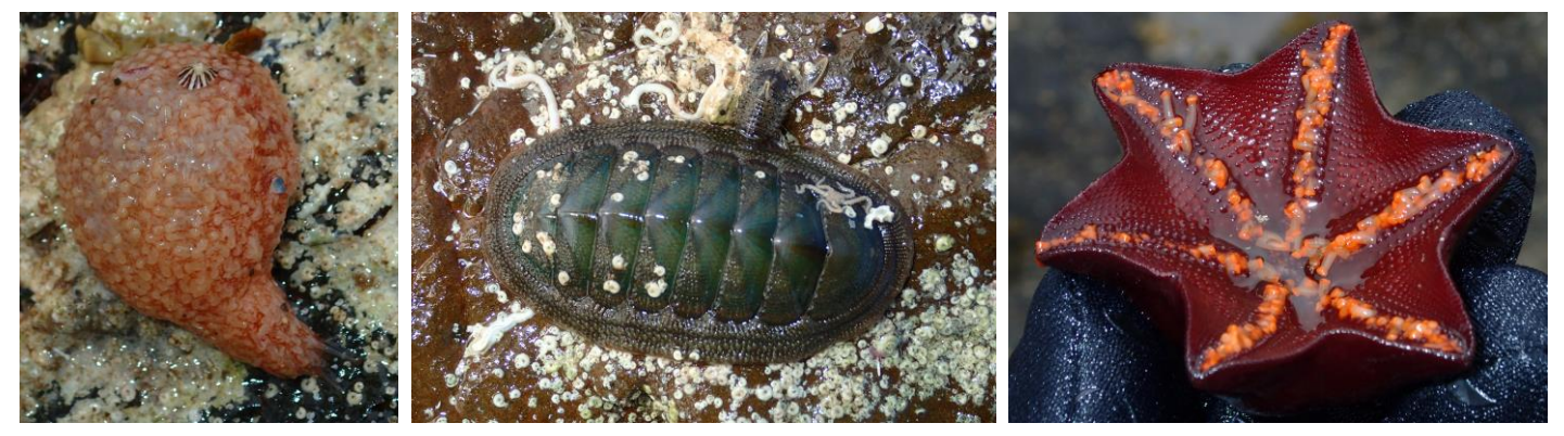
Lipotrapeza vestiens (Sea Cucumber)

Arriving at 10:30am and following the excursion briefing, we headed across the "stalk" of the mushroom to access the intertidal platform. Once on the reef, we quickly scanned for any bird life (that wasn't being blown away in the strong winds) then worked our way through the various rock-pools. Led by Cecily, Joan and Carol, who have long been interested in all things marine, we combed the rockpools for interesting creatures. It wasn't long before there was much excitement around the numerous brittle sea stars we were finding – almost under every rock! We also found cushion stars, elephant snails, flat worms, crabs, and an especially beautiful Meridiastra gunnii (Purple Sea Star).