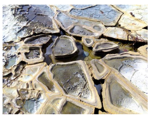
Patterns on the platform

On Saturday, 3 locations were visited: The Desalination Plant; Wonthaggi Wetlands and the Mouth of the Powlett River. At the Desalination Plant, members were impressed by the huge effort made to successfully revegetate the area with indigenous species. Even the roof of the main building had been turned into a grassy heathland. Wonthaggi Wetlands provided a natural oasis near the town centre with some fine trees and plentiful bird life. An echidna shambling along near the lunch spot provided one of the few mammal sightings. At the Powlett River, some members opted for a shorter walk, but those who rose to the challenge of the full circuit were rewarded with sightings of 2 Double-banded Plovers (early migrants from New Zealand) and several Hooded Plovers.