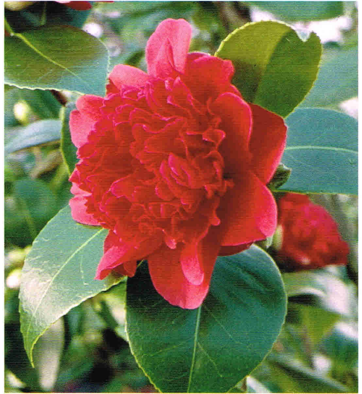
Camellia 'Takanini' See Letters on p.8

The 2007 seed list is as impressive as ever: we must hope it will continue to be so, and to provide interesting material for our members at home and abroad. The Group is having, though, to face up to the increasing number of regulations about importing, exporting and collecting plants, and has to pay strict attention to the rules pertaining in various countries - not an easy task. We have, to a large extent, to count on members giving us the necessary information for us to despatch seed legally, and do hope that those living outside the EU will inform us of any changes to the relevant regulations.