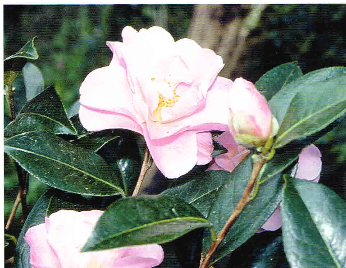
Camellia 'Nicky Crisp'

Betty Durrant's 1979 introduction, C. pitardii var pitardii x C. japonica 'Nicky Crisp' is at last gaining the popularity it deserves over here, but it is not very popular with nurserymen as it is such a free flowering compact grower, slow to bring to saleable size.