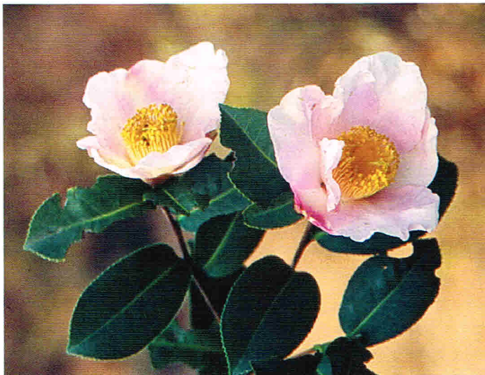
Camellia pitardii var. pitardii

Camellia pitardii var pitardii , which incidentally is believed by some taxonomists to be a form of C. saluenensis , is seldom seen in cultivation in its own right but I have seen some very beautiful examples in the wild in Sichuan, China. A very variable, hardy, drought tolerant species, it is generous with its flowers and, in reasonably warm summers, with its seed production. It has long been much favoured by New Zealand hybridists.