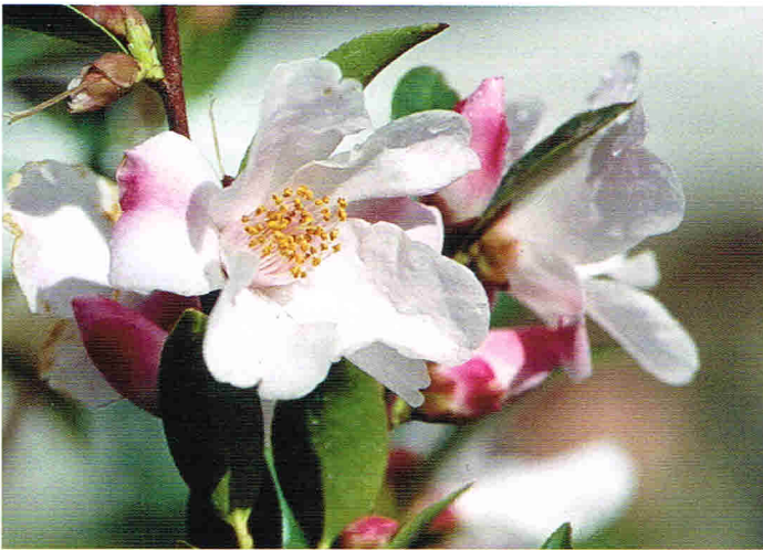
Camellia 'Festival of Lights'