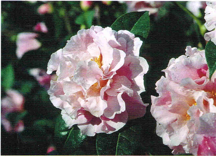
Camellia 'Nonie Haydon'

abundance of blooms when seen at Rhodoglen. It is upright too, suitable for fitting into the odd sheltered sunny corner in southern England and for growing in containers. Neville named this “after an amazing exhibition that was running during my visit to Kunming in 1991”.