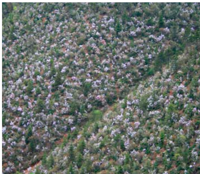
Hillside of Syringa yunnanensis

The next stop was made at around 12,000 ft (3650m.) where we found Primula ceruna and the much smaller and delightful Primula amethystina ssp. brevifolia , along with