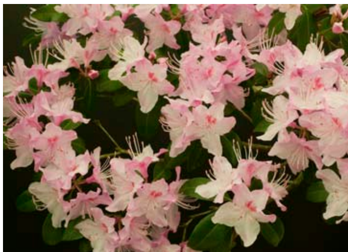
R. davidsonianum from Exbury Gardens—Class 19