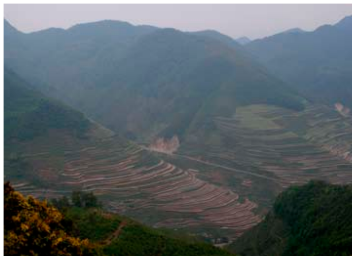
Narrow paddy fields up the steep mountainside

into the countryside where the local population were already tending their rice fields and vegetables (and tobacco fields). We drove over barley strewn roads: the threshing of the grain is completed by passing traffic. Wheat, maize, cabbages, beans and potatoes with terraced paddy fields dominating the increasingly hilly landscape. Bullock carts appeared on the scene, necessitating our first photo stop and introducing our tour leader Guan Kalyun, to his first experience that a 5 minute stop always lasted at least 15! As we got closer to our destination the rice terraces became steeper and narrower and the road more twisting, climbing ever upward, past Pieris formosa and rhododendrons rubiginosum and phaeochrysum - demanding another photo stop.