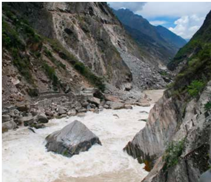
The ‘Tiger Leaping Gorge’ on the Yangtze River

With a change in our itinerary, on Friday 23 rd May, we were able to visit the Tiger Leaping Gorge, first driving beside the broad yellow Yangze river, with wonderful Catalpa fargesii in full flower, consuming strawberries from stalls alongside the road as we went. In the gorge there were spectacular views as the river powers its way between enormously high cliffs. Some took rickshaws along the footpath chiselled into the rock beside the river into the gorge but most walked along in the hot sunshine.