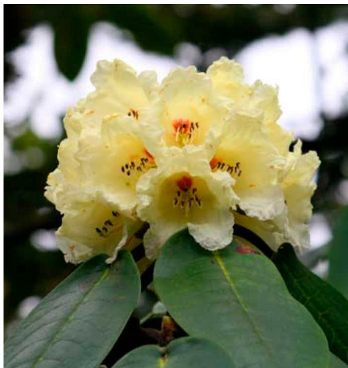
R. lacteum on the Wumenshan mountain.