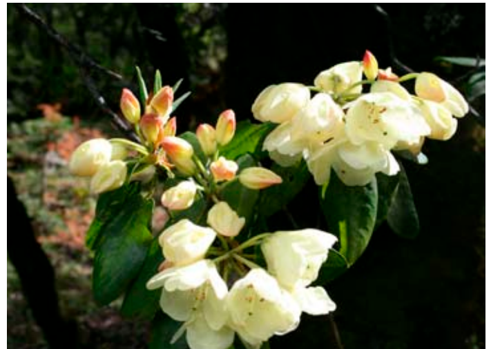
R. wardii , just coming into bloom

There was also R. rubiginosum and both continued to our highest stop (3650m.) where we wandered among R. wardii , R. russatum , R. racemosum and Berberis sp. (? stenophylla ).