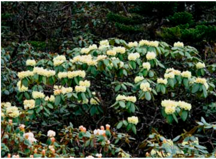
R. lacteum Looking down on a 3.5m tall plant

Growing more adventurous, we returned on foot to our coach through open woodland past many fine examples of R. phaeochrysum in flower, and some hybrids with attractive dense brown indumentum: A wonderful introduction to rhododendron in China.