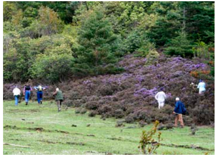
R. hippophioides and botanising members.

As we climbed higher, we spotted large numbers of R. ficolacteum , but not much flower until we reached higher altitudes.