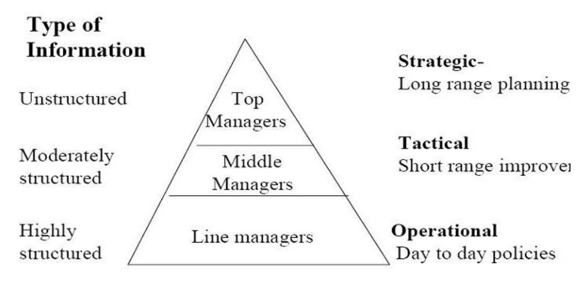
Figure: 1 Types of Information in Organization