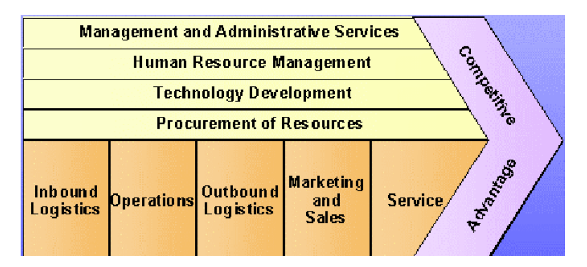
Figure: 2 Value Chain Analysis