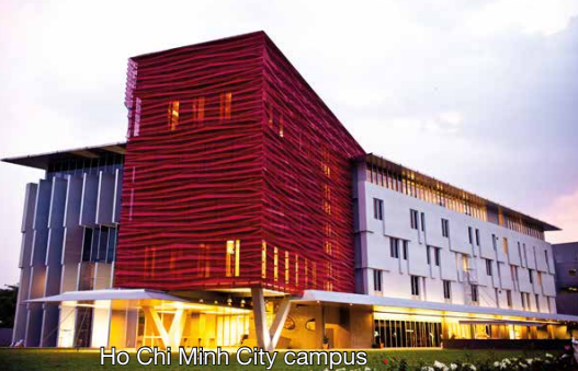
Ho Chi Minh City campus

RMIT is an international university of technology, design and enterprise with more than 96,000 students and close to 10,000 staff globally. We empower people and communities to adapt and thrive across generations, with education, research and civic engagement that are applied, inclusive and impactful.