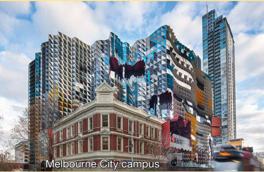
Melbourne City campus