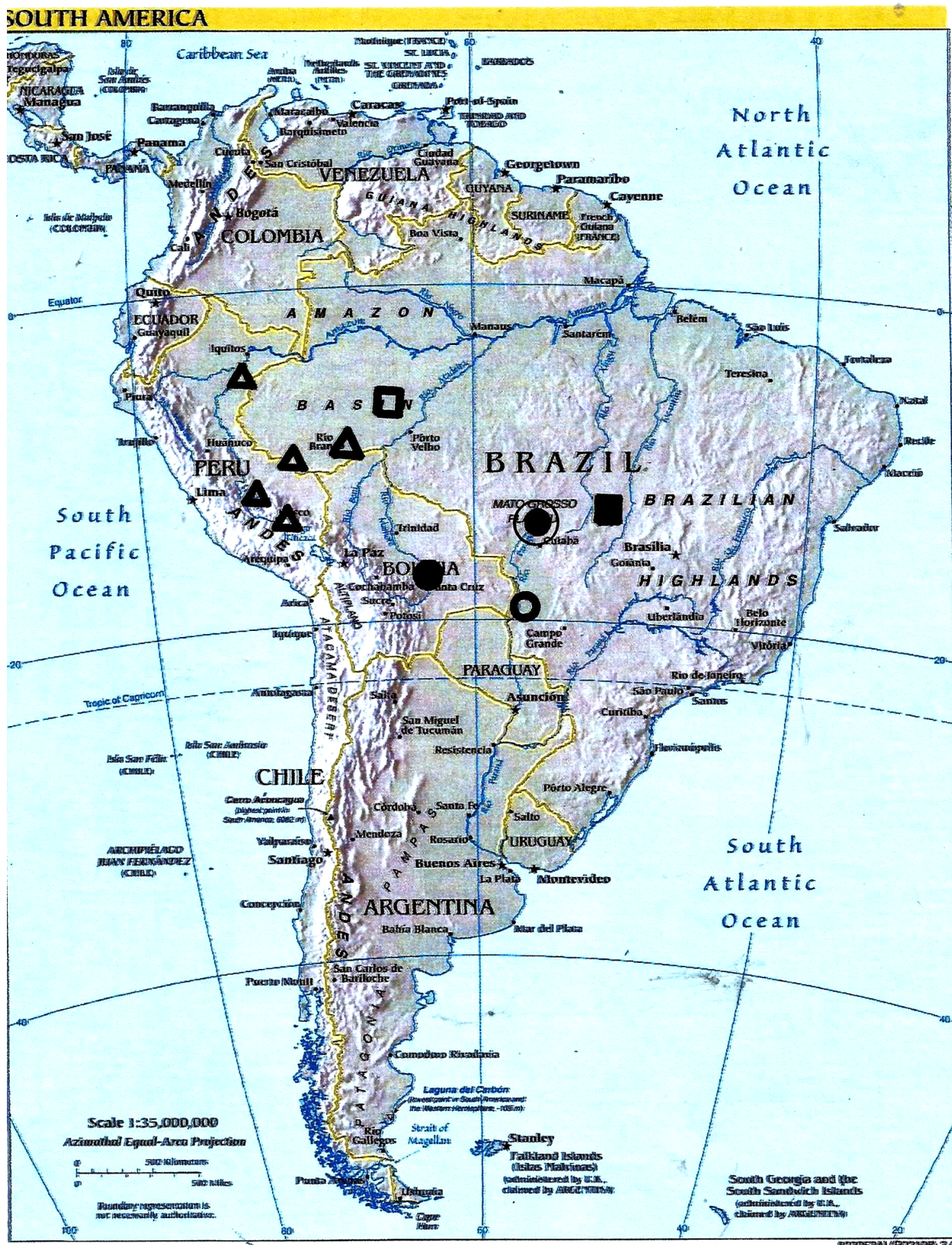
Figure 14. Map of South America showing the localization of the specimens examined several species of Apostolepis . Key: A. borellii (white circle), A. underwoodi sp. n. (black circle), A. aff. borellii (double circle); A. nigroterminata (white triangle), A. serrana (black square), and A. striata (white square).

blackish margins. Paraventral zone under pleural stripe is immaculate cream as well as along the ventral side from head to tail.