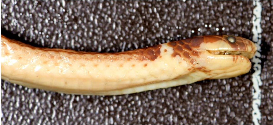
Figure 8. Paratype 1 of Apostolepis underwoodi sp. n. (BMNH.1927.8.1.180) from Santa Cruz, Bolivia.