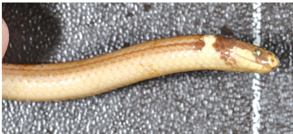
Figure 11. Paratype 2 of Apostolepis underwoodi sp. n. (BMNH.1927.8.1.182) from Santa Cruz, Bolivia.