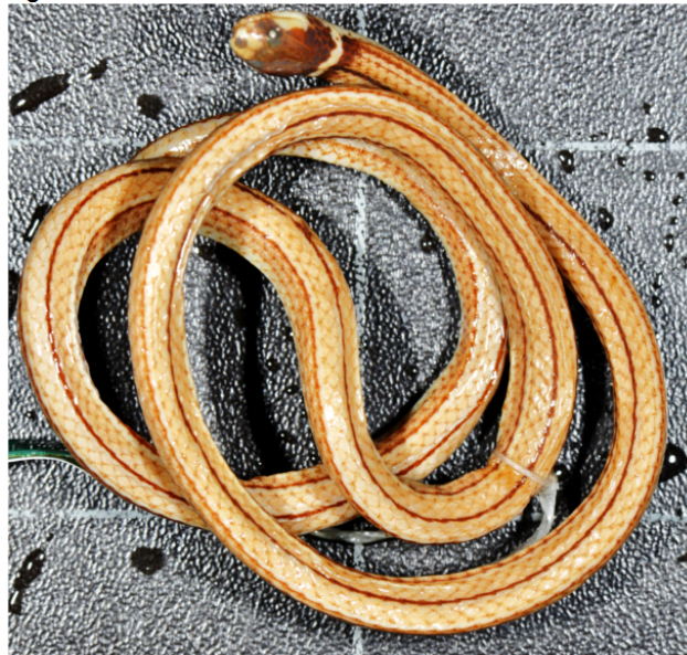
Figure 9. Paratype 1 of Apostolepis underwoodi sp. n. (BMNH.1927.8.1.180) from Santa Cruz, Bolivia.