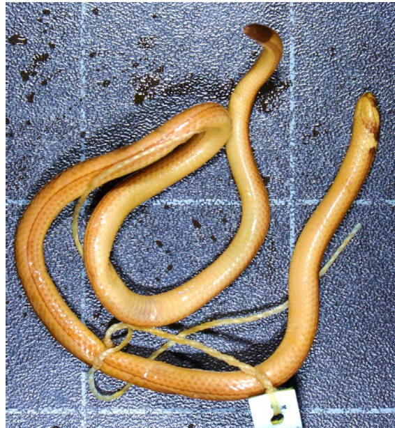
Figure 13. Paratype 2 of Apostolepis underwoodi sp. n. (BMNH.1927.8.1.182) from Santa Cruz Bolivia.

Type-specimens: BMNH.1927.8.1.180, female, holotype; paratypes: BMNH.1927.8.1.181, holotype, male, and BMNH.1927.8.1.182, male; from Buena Vista, Santa Cruz Department, Bolivia (17°27'32"S, 63°39'33"W), 398 m OLS ( Figure 14 ).