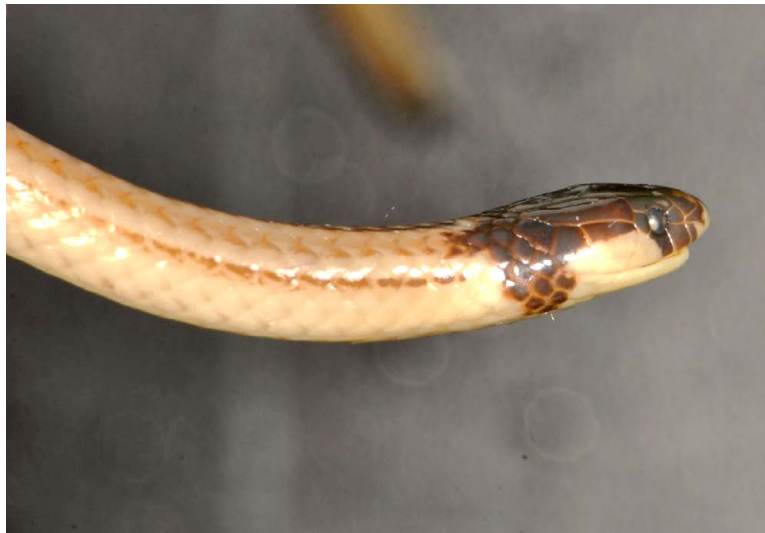
Figure 3. Holotype of Apostolepis serrana (BMNH.1972.430), from Serra do Roncador, Mato Grosso, Brazil.