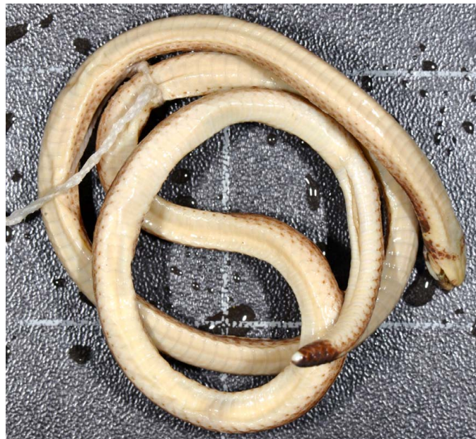
Figure 10. Paratype 1 of Apostolepis underwoodi sp. n. (BMNH.1927.8.1.180) from Santa Cruz, Bolivia.