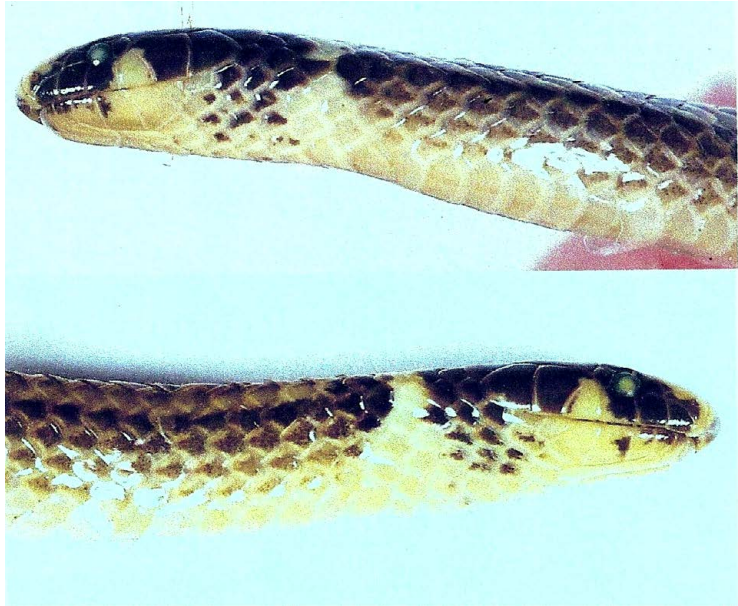
Figure 2. Holotype of Apostolepis borellii (MZUT.962), from Urucum Hill, Mato Grosso do Sul, Brazil.