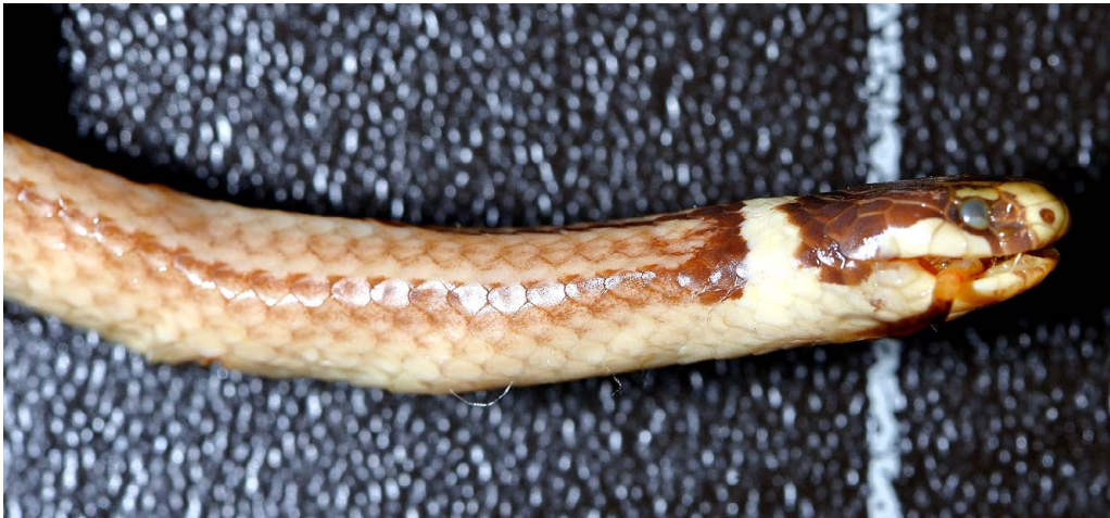
Figure 5. Holotype of Apostolepis underwoodi sp. b. (BMNH.1927.8.1.181) from Santa Cruz, Bolivia.