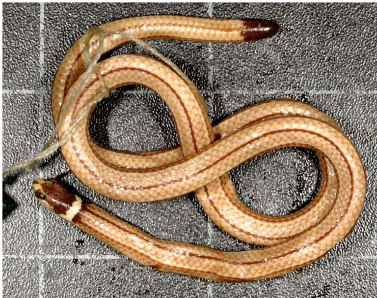
Figure 6. Holotype of Apostolepis underwoodi sp. n. (BMNH.1927.8.1.181) from Santa Cruz, Bolivia.