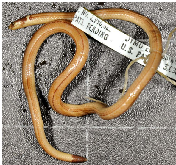
Figure 12. Paratype 2 of Apostolepis underwoodi sp. n. (BMNH.1927.8.1.182) from Santa Cruz Bolivia.