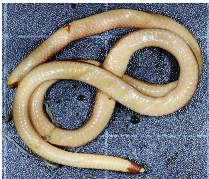
Figure 7. Holotype of Apostolepis underwoodi sp. n. (BMNH.1927.8.1.181) from Santa Cruz, Bolivia.