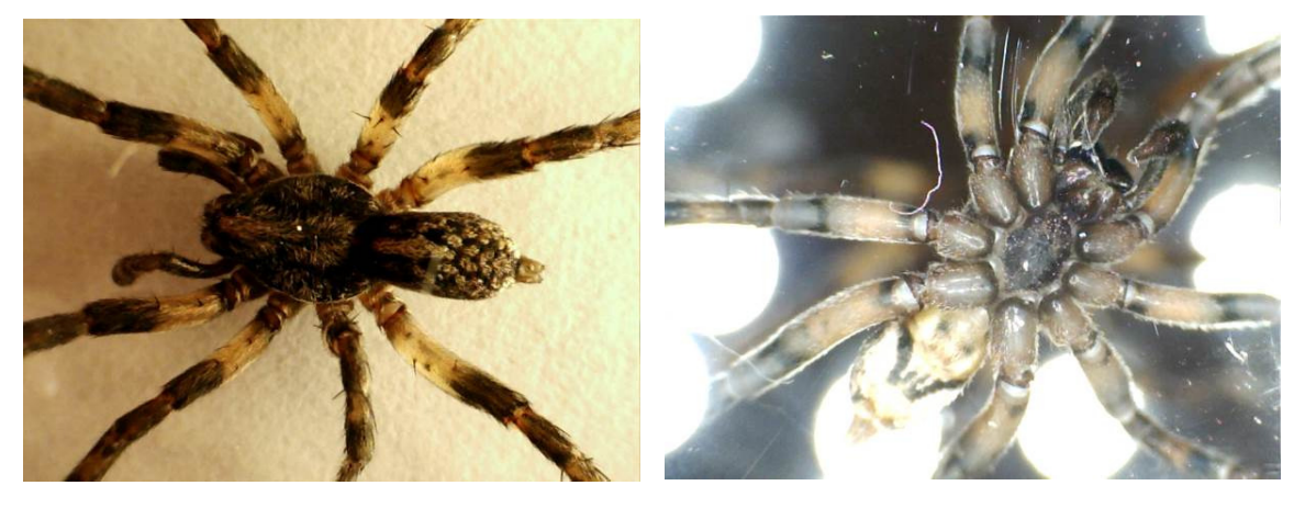
Mole spider, *Lycosidae sp?

Male spider as seen from above (left) and below (right) found at site SR19, mounds noted at SR19 and SR21.