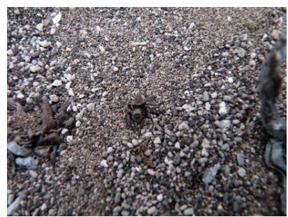
Unknown species – same as specimen collected from Crescent Gully (tube labeled Crescent gully mixed with Steatoda) but different to DG1972 and DG1980

Menemerus bivittatus and Hasarius adansoni were the most common salticids of Dry Gut and the southern ridge of PBP. These were also the common salticids of the low, dry parts of the island in the Belgian study. Both are worldwide and introduced species to St Helena, adapted to feeding during the day. In the more exposed northeastern parts of the island, the Belgians found (which the Ashmoles suggest is probably coincident with the EAA), there were two to three endemic species that in contrast lived under rocks or the shelter of samphire.