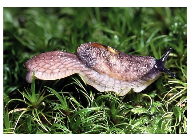
Figure 2. Warty Jumping-slug (Mount Brenton, Vancouver Island, 2001).