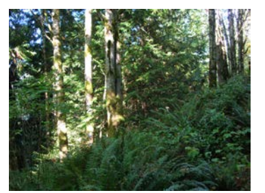
Figure 6. Moist second-growth habitat with red alder and bigleaf maple near East Sooke; Anderson Cove location. Note dense understory of sword fern.

This remnant patch was surrounded by recently harvested cutblocks. Five Warty Jumping-slugs were found within 2-person hours of intensive search. Several small creeks and pools of water were present in the patch. The forest floor was moist and contained abundant, layered coarse woody debris including large-diameter decaying logs.