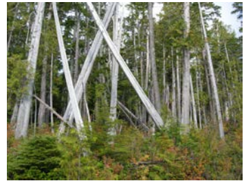
Figure 5. A remnant patch of western redcedar and western hemlock old-growth forest at Noyse Creek North, outside of Port Renfrew.

Both suitable forest structure and microhabitat conditions are essential for population persistence of Warty Jumping-slug over the long term. Key habitat features include moist forest floor conditions, abundant coarse woody debris, deep litter or moss layer that holds moisture, and shade provided by the forest canopy. Coarse woody debris at variable states of decay provides shelter, egg-laying sites, and a source of moisture for slugs. Across the landscape, suitable habitats must be connected to facilitate colonization of new habitats, repopulation of habitat patches from which the species might have disappeared, and genetic exchange that maintains variability and ability of populations to adapt to changing conditions. The dispersal ability of the Warty Jumping-slug is thought to be poor and is probably hindered by open habitats that do not maintain high humidity and moisture. Such habitats include recently logged areas and other disturbed habitats, especially at drier locations and within the heavily fragmented low-elevation coniferous forests of southern Vancouver Island.