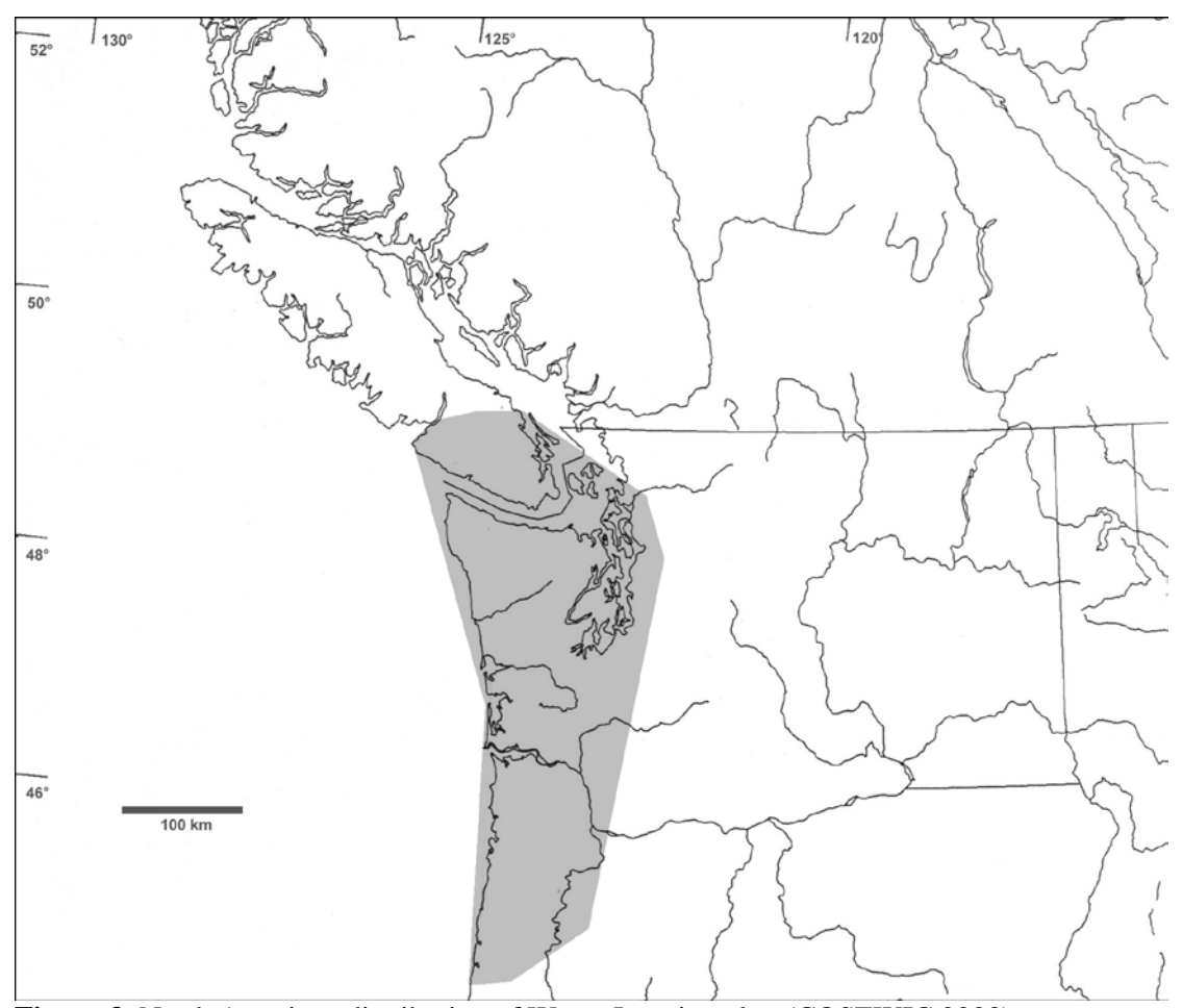
Figure 3. North American distribution of Warty Jumping-slug (COSEWIC 2003).

In Canada, Warty Jumping-slug is known from the southern third of Vancouver Island (Figure 4). The estimated extent of occurrence in B.C. is approximately 4700 km<sup>2</sup>, but the area of occupancy is a small fraction of this range (about 20–100 km<sup>2</sup>) although it cannot accurately be estimated at this time. As of September 2011, there are 16 extant locations<sup>2</sup>, most of which are on the west coast of Vancouver Island, from Barclay Sound south to Sooke Inlet (Table 1). Two locations on the east coast of Vancouver Island (Cowichan River and Nanaimo Lakes) are considered historic locations and because of lack of specific information pertaining to the exact spatial location, continued presence at these two locations is difficult to determine. No records exist from mainland B.C. (B.C. Conservation Data Centre 2011).