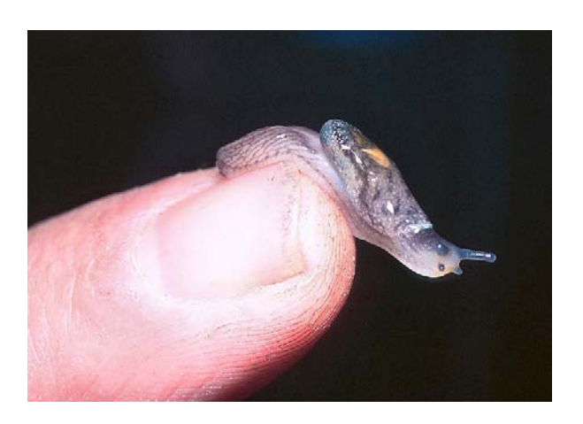
Figure 1. Warty Jumping-slug (Carmanah Valley, Vancouver Island, 2000).

Warty Jumping-slug is one of seven described species of jumping-slugs endemic to western North America (family Arionidae: genus Hemphillia ) (Turgeon et al. 1998). No subspecies of Warty Jumping-slug have been recognized, but recent molecular studies have revealed much genetic fragmentation among populations from different geographic areas, suggesting the nominal species H. glandulosa may represent a complex of sister species (Wilke 2004).