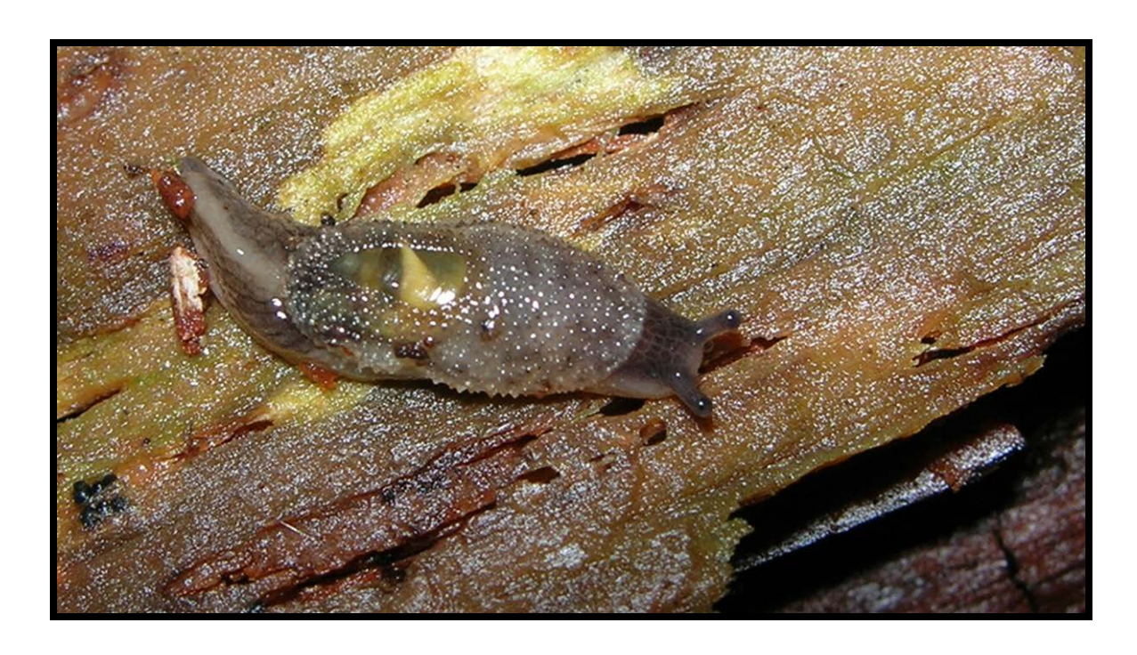
Prepared by the Warty Jumping-slug Management Team