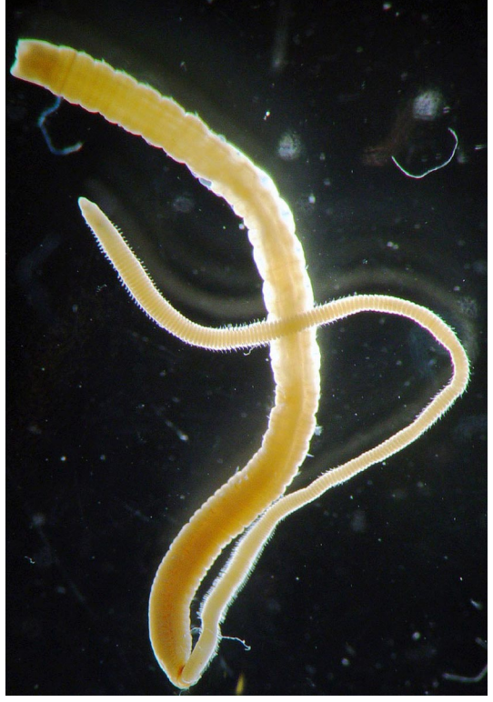
Figure 2. Drilonereis emerging from Chone mollis