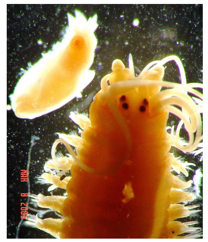
Figure 3. Platynereis bicanaliculata with an unhatched squid