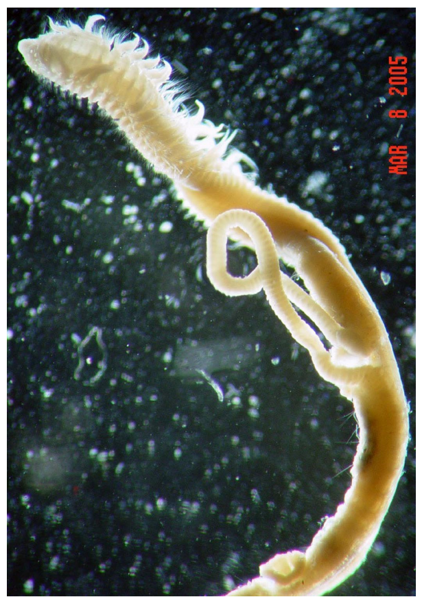
Figure 1. Drilonereis emerging from Aricidea ( Acmira ) horikoshii