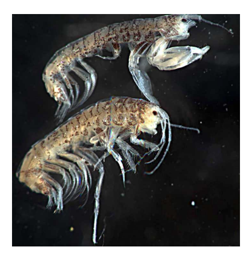
Rudilemboides stenopropodus