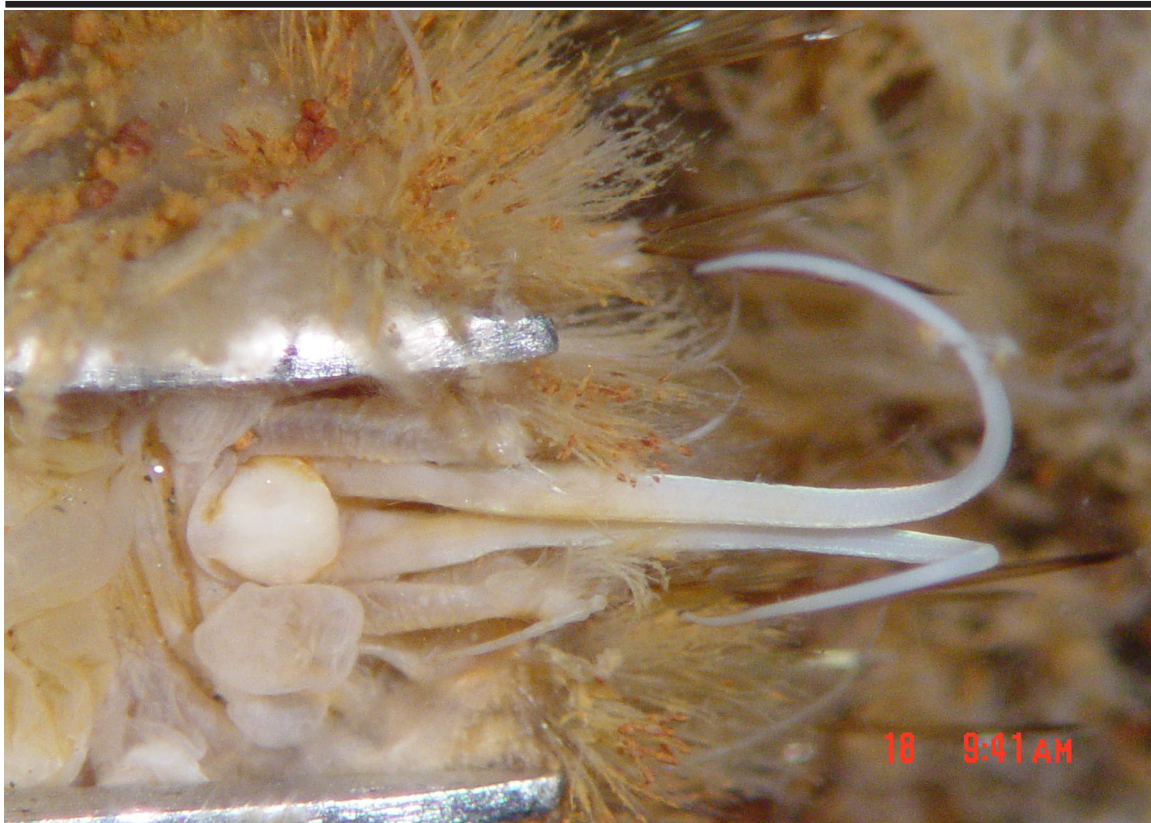
Aphrodita longipalpa , prostomium and palps, note no eyes visible. From LACSD collection. Photo credit Larry Lovell.