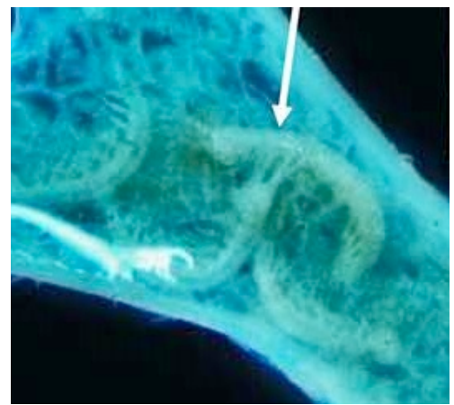
Bryoconversor tutus in the colony of Onchoporoides moseleyi . The arrow points to three juvenile amphipods under the membrane surrounding the colony (from Lörz et al 2014)

"Head lateral cephalic lobe weakly extended, eye situated proximal to lobe; anteroventral margin weakly recessed, moderately excavate. Mandible palp article 3 asymmetrical, distally rounded, setae extending along most of posterodistal margin, posterior margin with setae of variable length. Gnathopod 1 not enlarged in either males or females; coxa 1 as large or larger than coxa 2. Gnathopod 2 in males larger than gnathopod 1. Pereopod 5 carpus small, lunate, dactylus with or without accessory spine on anterior margin. Urosomites 1 and 2 coalesced. Uropod 3 peduncle short, length 2 times or less breadth, with sides expanded; outer ramus without recurved spines. Telson without hooks or denticles." (Myers and Lowry 2003).