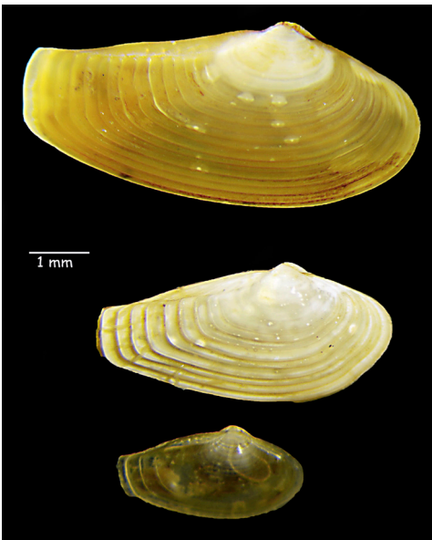
Fig. 2 – Nuculana leonina , Cascadia Slope, EBS-64, 950 m, K. Barwick personal collections (from SCAMIT 2009)