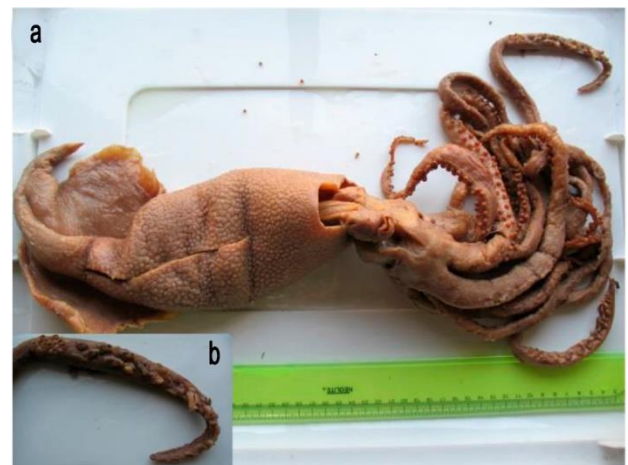
Figure 6. Onykia robsoni MNHNCL 1950. a) Complete specimen, ML 380 mm, b) Club 118 mm.

about half of mantle length (55% ML). Arms long with two sucker rows (55-75% ML); tentacle club length 38% ML, with 25-27 large hooks, 9-19 carpal suckers, and 12-13 terminal pad suckers (Fig. 6, Table 1).