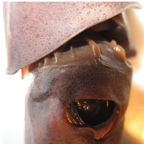
Figure 2. Detail of head, eye and nucal folds of Onychoteuthis aequimanus MNHNCL 1954-2. Complete specimen, ML 106 mm.

by S. Avilés & P. Ojeda, December 3, 1977. " Moroteuthis " ingens 380 mm ML (southern Chile, 52°06'S, 75°47'W) MNHNCL 5805. Collected November 22, 1977.