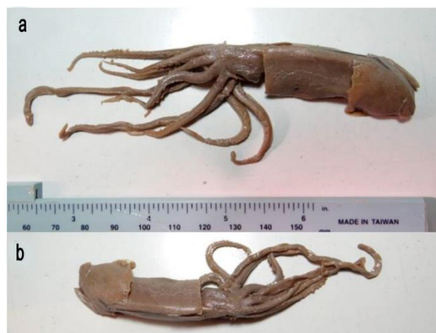
Figure 8. Kondakovia nigmatullini MNHNCL 841. a) Dorsal view, ML 62 mm, b) ventral view.

Squids identified as “ Moroteuthis ” from MNHNCL belong to the genus Onykia . Onykia ingens inhabits the continental shelf of Chile, from 42°S southward in cold waters of Antarctic origin deeper than 300 m (Ibáñez et al. , 2009). Alexeyev (1994) found one juvenile specimen of O. ingens at 39°04’S, 93°50’W. This species has been reported in stomach contents of Patagonian toothfish ( Dissostichus eleginoides ) from the continental slope (>500 m) of southern Chile (43°S) (Murillo et al. , 2008). Onykia robsoni , in Chile, is distributed in more northern waters than O. ingens , from 32°S southward. In addition, Alexeyev (1994) found several juvenile specimens of O. robsoni between 35° and 0°S.