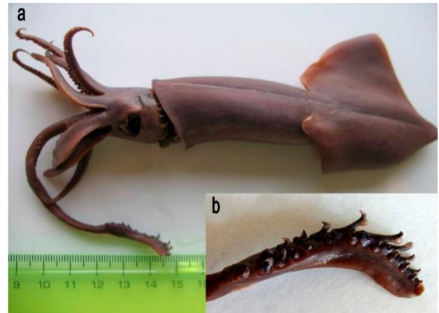
Figure 1. Onychoteuthis aequimanus MNHNCL 1954-2. a) Complete specimen, ML 106 mm, b) Club, 29 mm.

Material examined: " Moroteuthis " ingens (3 specimens) 93, 87, 90 mm ML (southern Chile, 55°29'S, 70°03'W, 350-357 m depth) MNHNCL 5747. Collected