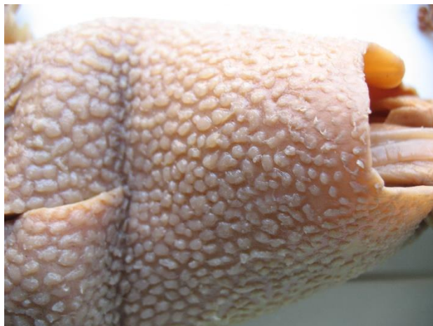
Figure 7. Detail of mantle warts of Onykia robsoni MNHNCL 1950. Complete specimen, ML 380 mm.

In the southeastern Pacific Ocean (SEP), onychoteuthid squids are poorly represented in regional and international collections, and holdings represent only four species. We reported the presence of four species based on museum collections and an examination of the literature. The genera Onykia and Kondakovia in the SEP are distributed in cold waters of the southern Ocean down to 30°S, while Onychoteuthis is common in warmer oceanic waters from 30°N to 30°S (Ibáñez et al. , 2009; Bolstad, 2010).