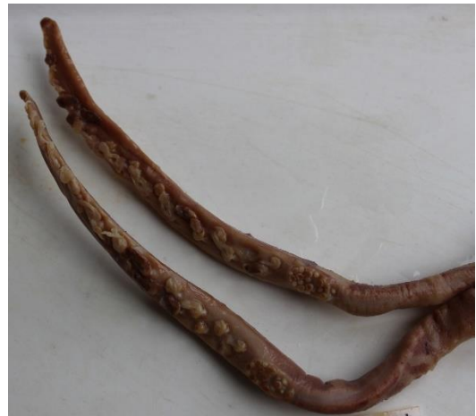
Figure 5. Detail of tentacle club of Onykia ingens MNHNCL 5747. Complete specimen, ML 93 mm.

Description. Large squid (380 mm ML) (Fig. 6). Mantle fleshy, spindle-shaped, narrow cone over posterior (Fig. 6). Dorsal and ventral surfaces of mantle studded with, well-separated, blister-like warts (Fig. 7). Fin length