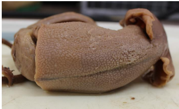
Figure 4. Detail of mantle warts of Onykia ingens MNHNCL 5747. Complete specimen, ML 93 mm.

'warts' over all surfaces (Fig. 4). Arms long with two sucker rows (61-97% ML). Fins broad, smooth, rhombic, length about half of mantle length (46-57% ML); tentacle club narrow (Fig. 5), length 29-35% ML, with 25-28 large hooks, 12 carpal suckers, and 13-17 terminal pad suckers (Fig. 2, Table 1).