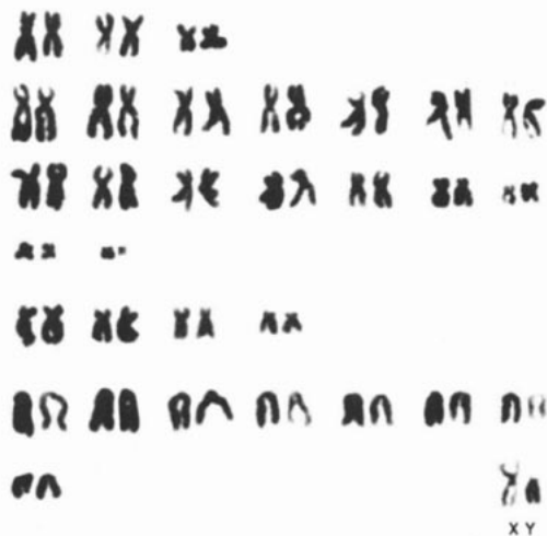
FIG. 4. Karyotype of Dipodomys deserti (Hsu and Benschke, 1975).

Females react when disturbed by trying to move young from one nest to another. Moving is accomplished by grasping the young across the middle of the back or behind the head with her mouth, hopping away with one animal, and then returning for another. The jaws of the female nearly encompass the body of the young; the forelimbs are used for balance and to assist in carrying the young. After about 21 days, juveniles are left to care for themselves. Females may cover young with nesting material when they must leave the nest. Males may exhibit paternal behavior and may be gentler with the young than the mother. Older juveniles may chase adult males out of food areas by biting and pulling at their pelage (Butterworth, 1964).