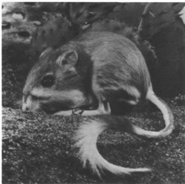
FIG. 1. Dipodomys deserti arizonae from 4 mi. S, 1 mi. E Picacho, Pinal Co., Arizona.

seeds (Eisenberg, 1975). There are four toes on each hind foot and the foot is covered with relatively long hairs (Nader, 1978). The tail amounts to 143% of the length of head and body or about 58% of the total length. A ventral, dark tail-stripe usually is absent. The distal one-third of the tail is crested and the long hairs of the crest