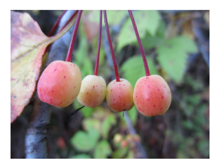
Figure 6. Pacific crabapple ( Malus fusca ), a late summer/fall ripening fruit, ready to harvest in the WSÁNEĆ moon ĆENQOLEW_(chankw'alax) ("dog salmon return to Earth"). (Photo by N. Turner).

food for emergency use, and leadership, with effective planning and decision-making, have been key elements for people's survival in times of unexpected trauma. For example, as described by Mayanilth Daisy Sewid-Smith of the Kwakwaka'wakw Nation, on one occasion in the late 1700s when the salmon run failed on the Nimpkish River on northeastern Vancouver Island, the Chiefs of the villages along the river decided to move all the people down to the mouth of the river, where they had houses built for them, and where they could live on clams in the interval when the salmon were scarce. In fact, archeological evidence shows that there have been many fluctuations in peoples' use of different foods over time, presumably to accommodate times of shortage of one species or another (Ames & Maschner, 1999). Using alternative foods was, and remains, one strategy for coping with unexpected change (Turner & Davis, 1993). In fact, there were and are a number of diverse environmental care practices that help people to maintain and promote culturally-significant species, as described in the following section.