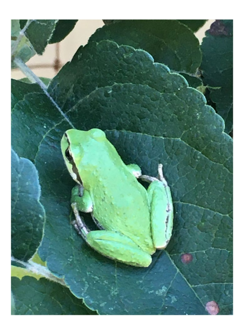
Figure 5. Pacific tree frog ( Pseudacris regilla ); its spring chorus inspired the WSÁNEĆ name of the early spring moon: WEXES ( wəxəs ) ("moon of the frog").

some occurring in ancient times, some more recent, that had to be overcome in one way or another. For example, the Nisga'a experienced a horrific volcanic eruption over 250 years ago (Williams-Jones et al., 2020), in which a huge area of the Nass River Valley was filled with lava, covering entire villages, causing major loss of life (>2,000 Nisga'a lives), and changing the course of the river, as well as covering vegetation and impacting fish and wildlife. Even in areas not covered by lava, the destruction of berries and other food plants would have been immense (see Hunn & Norton, 1984, for a description of the impact on berries of the Mount St. Helen's eruption in May 1980). This event was translated into a lesson, still taught today, about how salmon had been disrespected and harmed by some young boys by putting burning sticks into the backs of salmon and watching them swim up the river in the dark with their backs glowing. To this day, the occurrence of the volcano is associated with this abusive act, and the story teaches young people to always treat the animals (and all life) respectfully. Similar lessons teaching respect for the environment are embodied in many other narratives (e.g., Johnson, 2010; Johnson & Hunn, 2010).