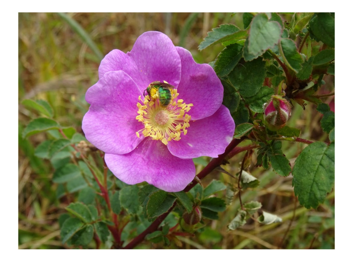
Figure 2. Nootka wild rose ( Rosa nutkana ); its coming into bloom is a key indicator of the time for Lil'wat basketmakers Nellie Peters and Margaret Lester to start harvesting the materials for their coiled cedarroot baskets: decorative grass stalks, bitter cherry bark, cedar roots and cedar splints.

develop approaches and policies required to halt and reverse global environmental change.