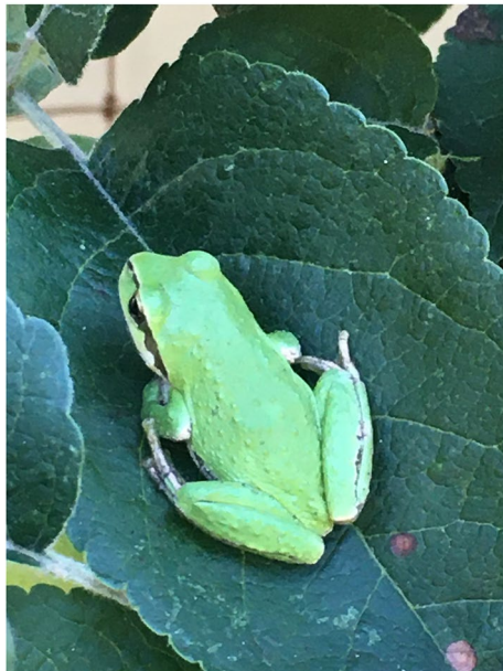
Figure 5. Pacific tree frog ( Pseudacris regilla ); its spring chorus inspired the W̱SÁNEĆ name of the early spring moon: WEXES ( waxas ) (“moon of the frog”).

some occurring in ancient times, some more recent, that had to be overcome in one way or another. For example, the Nisga'a experienced a horrific volcanic eruption over 250 years ago (Williams-Jones et al., 2020), in which a huge area of the Nass River Valley was filled with lava, covering entire villages, causing major loss of life (>2,000 Nisga'a lives), and changing the course of the river, as well as covering vegetation and impacting fish and wildlife. Even in areas not covered by lava, the destruction of berries and other food plants would have been immense (see Hunn & Norton, 1984, for a description of the impact on berries of the Mount St. Helen's eruption in May 1980). This event was translated into a lesson, still taught today, about how salmon had been disrespected and harmed by some young boys by putting burning sticks into the backs of salmon and watching them swim up the river in the dark with their backs glowing. To this day, the occurrence of the volcano is associated with this abusive act, and the story teaches young people to always treat the animals (and all life) respectfully. Similar lessons teaching respect for the environment are embodied in many other narratives (e.g., Johnson, 2010; Johnson & Hunn, 2010).