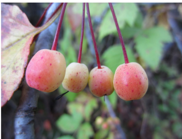
Figure 6. Pacific crabapple ( Malus fusca ), a late summer/fall ripening fruit, ready to harvest in the W̱SÁNEĆ moon ĆENQOLEW ( chankw'alax ) (“dog salmon return to Earth”).

food for emergency use, and leadership, with effective planning and decision-making, have been key elements for people's survival in times of unexpected trauma. For example, as described by Mayanilth Daisy Sewid-Smith of the Kwakwaka'wakw Nation, on one occasion in the late 1700s when the salmon run failed on the Nimpkish River on northeastern Vancouver Island, the Chiefs of the villages along the river decided to move all the people down to the mouth of the river, where they had houses built for them, and where they could live on clams in the interval when the salmon were scarce. In fact, archeological evidence shows that there have been many fluctuations in peoples' use of different foods over time, presumably to accommodate times of shortage of one species or another (Ames & Maschner, 1999). Using alternative foods was, and remains, one strategy for coping with unexpected change (Turner & Davis, 1993). In fact, there were and are a number of diverse environmental care practices that help people to maintain and promote culturally-significant species, as described in the following section.