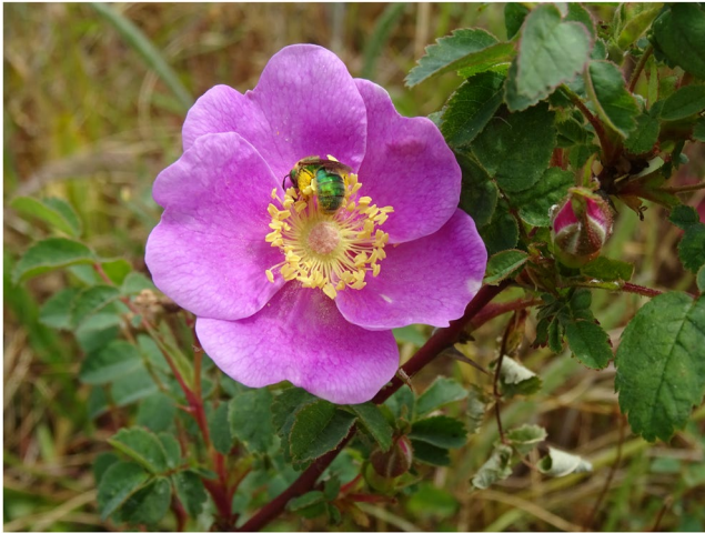
Figure 2. Nootka wild rose ( Rosa nutkana ); its coming into bloom is a key indicator of the time for Lil'wat basketmakers Nellie Peters and Margaret Lester to start harvesting the materials for their coiled cedarroot baskets: decorative grass stalks, bitter cherry bark, cedar roots and cedar splints. (Photo by N. Turner).

develop approaches and policies required to halt and reverse global environmental change.