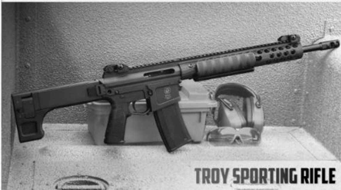
Troy Sporting Rifle – Pump Action