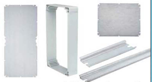
Additional accessories on page 48. Flange accessories on page 50.