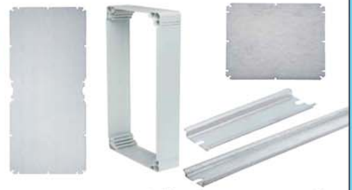
Additional accessories on page 48. Flange accessories on page 50.