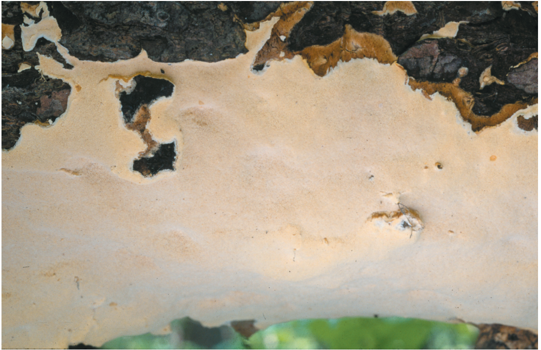
Fig. 8. Perenniporia subacida (Peck) Donk. A fresh pileate basidiocarp, specimen Dai 2138 . in situ , \times 0.4 .