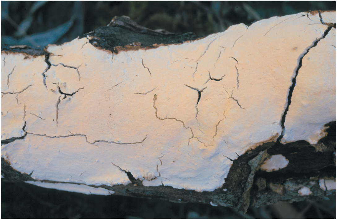
Fig. 7. Perenniporia cf. corticola (Corner) C. Decock. A fresh pileate basidiocarp, specimen Dai 3257 . in situ , \times 0.5 .