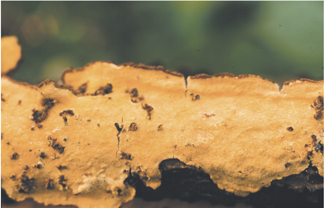
Fig. 6. Perenniporia maackiae (Bondartsev & Ljub.) Parmasto. A fresh pileate basidiocarp, specimen Dai 2397. in situ , \times 0.7 .