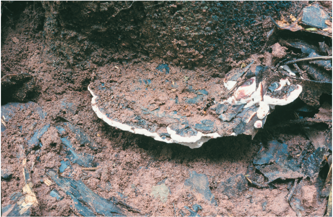
Fig. 5. Abundisporus fuscopurpureus (Pers.) Ryvarden. A fresh pileate basidiocarp, specimen Dai 3098e . in situ , \times 0.4 .

Perenniporia podocarpi was described from New Zealand (Buchanan 1992). Its basidiocarps are perennial, pore surface is white to cream coloured, and pores are larger (1–2 per mm) than in P. piceicola . The lack of cystidia, and distinctly larger, strongly dextrinoid spores ( 16.4\text{--}23 \times 7.5\text{--}9.5 \mu\text{m} , Decock et al. 2000) are additional characters that separate P. podocarpi from the new species.