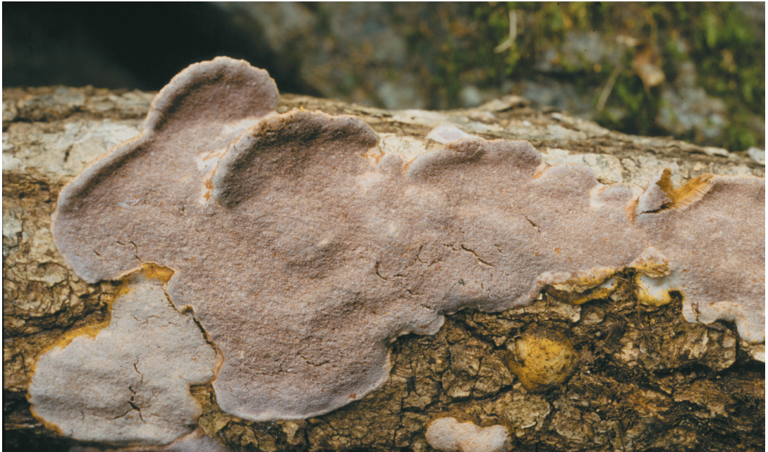
Fig. 4. Abundisporus pubertatis (Lloyd) Parmasto. A fresh pileate basidiocarp, specimen Dai 2179. in situ , \times 0.8 .

Basidiocarps annual to biennial, resupinate, ca. 5 cm or more in longest dimension, soft corky when fresh, becoming tough corky when dry. Sterile margin very narrow. Pore surface pale yellowish; pores round, 2–3 per mm, tube mouths entire. Subiculum ochraceous, corky, up to 2 mm thick. Tubes yellowish ochraceous or straw coloured, corky, up to 3 mm long.