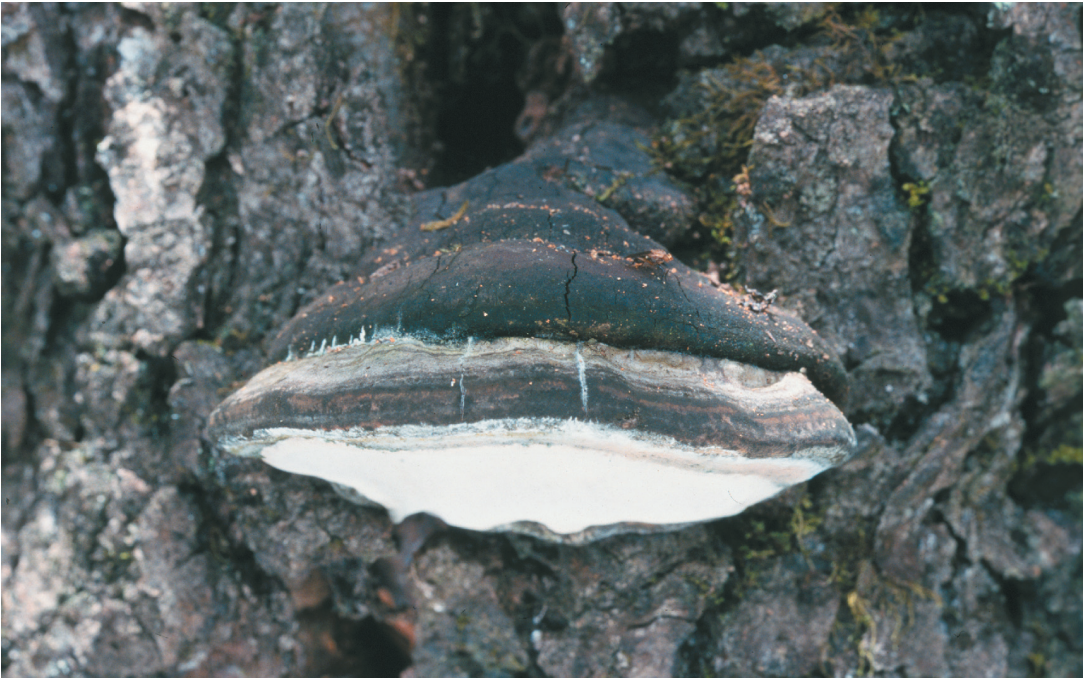
Fig. 2. Abundisporus quercicola Y.C.Dai. A fresh pileate basidiocarp, specimen Dai 3084. Photograph Y.C.D., in situ , \times 0.6 .

to almost black, smooth, concentrically zonate, margin blunt, greyish black. Pore surface white when fresh, becoming ochraceous when dry; pores round, 5–7 per mm, tube mouths entire. Context dark brown, corky, up to 3 cm thick. Tubes dull brown, paler than context, corky, up to 2 cm long, a thin layer of context present between each annual tube layer.