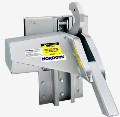
AR-10K SMART-HOOK® RESTRAINT

INSTALLED & SERVICED BY SHOPPA'S MATERIAL HANDLING