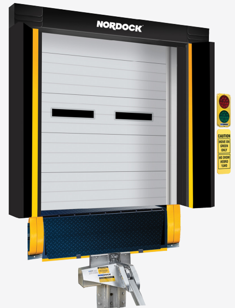
SEAL-TITE® STP SERIES DOCK SEAL

INSTALLED & SERVICED BY SHOPPA'S MATERIAL HANDLING