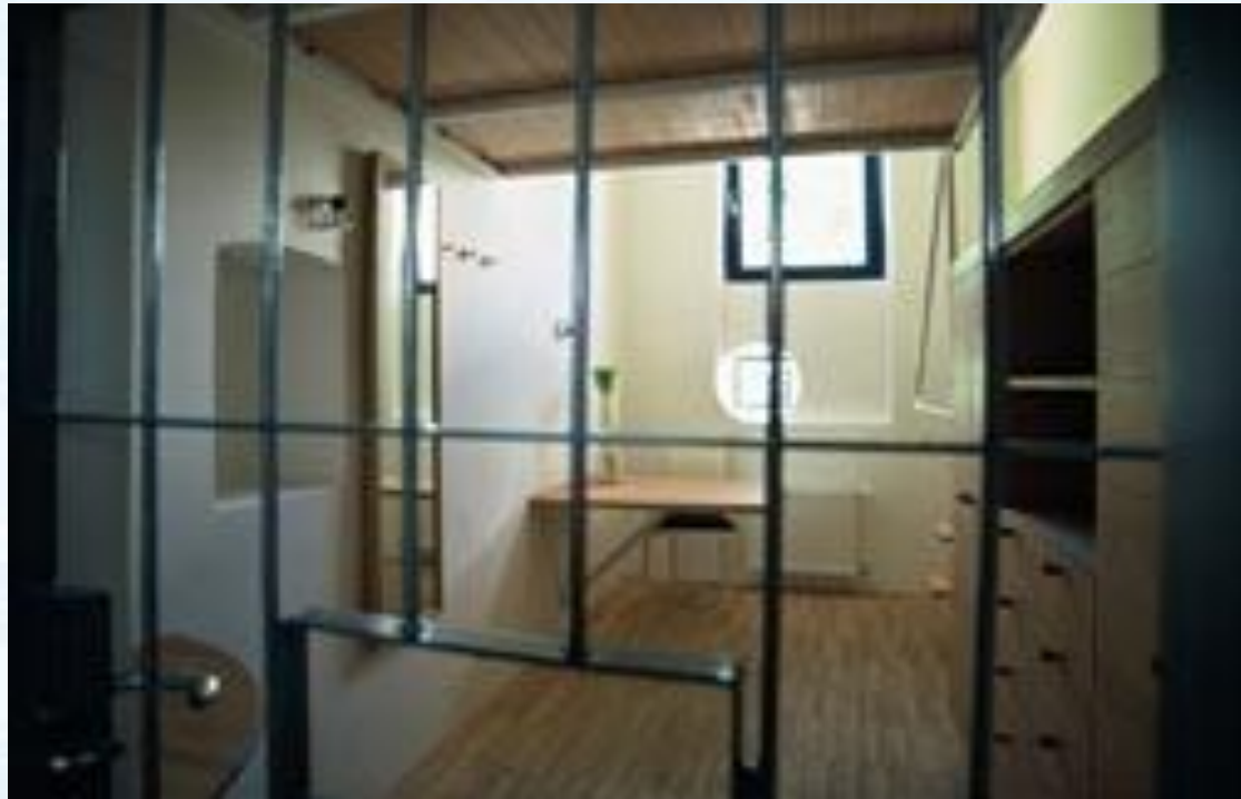
Renovated prison cell