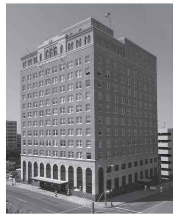
ROBERT E. LEE BUILDING 239 North Lamar Street

building the two floors of archival storage into the hillside and by recessing the fifth floor along the two facades facing the Old Capitol block. The facility's major programmatic divisions are public areas for the study of State archives, administrative office spaces, archivists work areas, and archival stack storage areas.