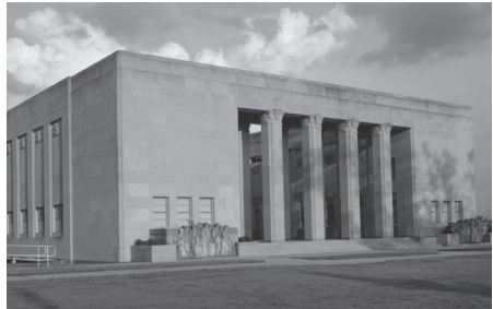
WAR MEMORIAL BUILDING 120 South State Street

Constructed in 1924, the building now housing the Secretary of State's offices was originally a library designed by architect N.W. Overstreet. The neoclassical Italian Renaissance-revival building was renovated in 1980. The two-story building contains 12,520 square feet of office and meeting space.