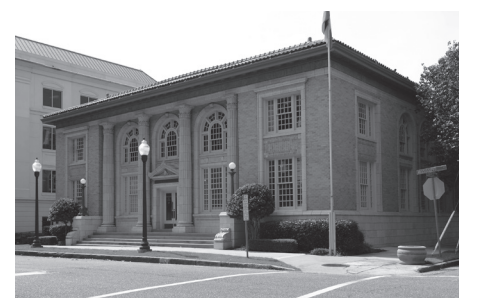
HEBER LADNER BUILDING 401 Mississippi Street

The state Supreme Court has been housed in various places since its inception in 1818. The court originally met in Natchez at the Adams County Courthouse. It briefly moved to Monticello from 1826 to 1828 and then back to Natchez. The court met inside the Old Capitol in Jackson from 1839 to 1903. In 1974, the court moved from the present Capitol to the original Gartin Justice Building.