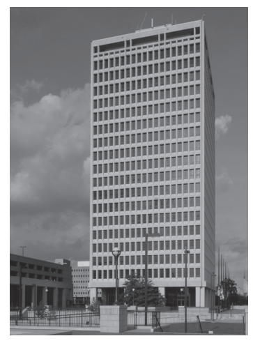
WALTER SILLERS BUILDING 550 High Street

Currently, the Sillers Building houses the offices of Medicaid, the Attorney General and other state agencies.