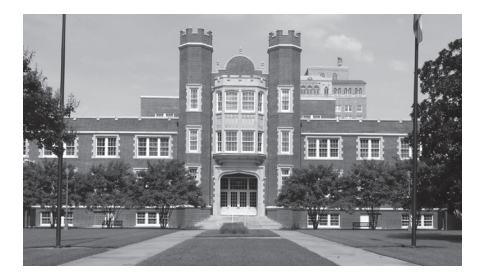
CENTRAL HIGH SCHOOL 359 North West Street

The Italian Renaissance-style building was built in 1930 as a luxury hotel designed by Jackson architect Claude H. Lindsley. In 1969, the 115,300-square-foot building was sold to the state and remodeled for government offices. It was again renovated in 1981 and 2011.