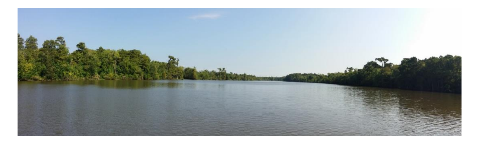
Lower Sabine River