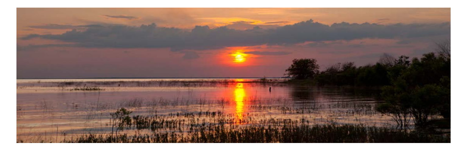
Sunset over Lake Tawakoni