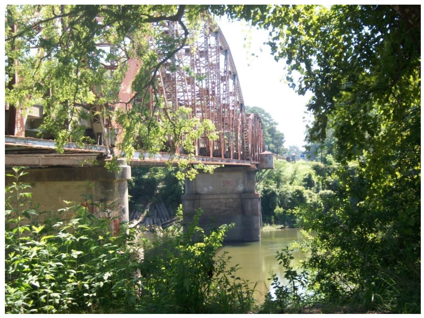
Sabine River at SH 63