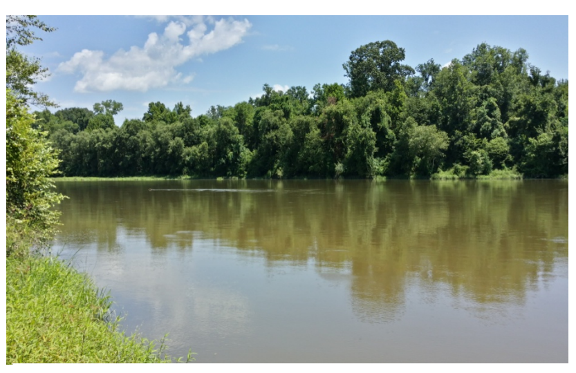
Sabine River at US 190

Through the Texas Clean Rivers Program (TCRP), the Texas Commission on Environmental Quality (TCEQ) forms partnerships with regional water authorities to coordinate and conduct water quality monitoring, and to promote stakeholder interest to assist in improving the water quality of Texas surface waters. The Sabine River Authority of Texas (SRA-TX) is the planning agency for all TCRP activities within the Sabine River Basin.