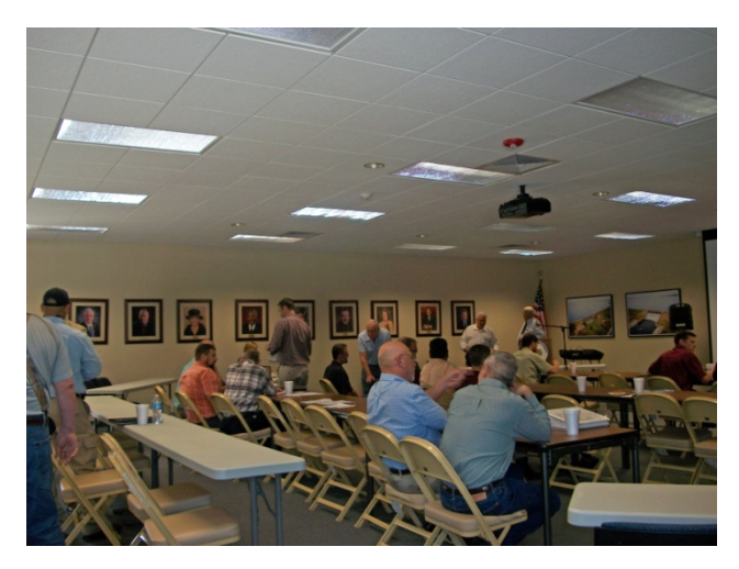
OC TMDL Stakeholder Meeting