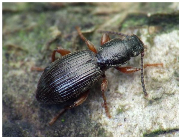
Fig. 6. Laena reitteri Weise, 1877 (Tenebrionidae)

Localities: Meseş Mts, 1.5 km SW of Huta, 570 m, 46.994°N, 22.929°E, beech forest, pitfall trap, 12.VIII.2014, GK, AO & GP (No. 83); Munţii Meseşului, Poic, Satul Murez, 47.00385°N, 22.92219°E, 775 m, beech forest, sifting, 28.IV.2015, CK (No. 140); Cliţ, 47.284°N, 23.439°E, hornbeam-oak forest, sifting, 11.V.2015, AP (No. 172).