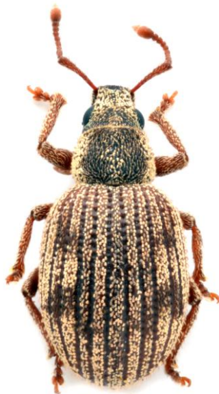
Fig. 7. Brachysomus ornatus Stierlin, 1892 (Curculionidae)

Localities: Huta, 46.99394°N, 22.92883°E, beech forest, hand collecting, 21–23.V.2014, ZB, AG, GK & CK (No. 38); Carastelec, 47.304°N, 22.671°E, 240 m, forest edge, dry grassland and swamp, swept, 5.VI.2014, AO, GP, ZS & MT (No. 75); Munții Meseș, Poic, 46.980°N, 22.925°E, alder grove, sweeping, 12.V.2015, ArG, OM & VS (No. 181); Munții Meseș, Poic, 46.980°N, 22.925°E, wet meadow, sweeping, 12.V.2015, AP (No. 184); Munții Meseș, Poic, 46.980°N, 22.925°E, hornbeam-oak forest, sifting, 12.V.2015, AP (No. 185); Munții Meseș, Poic, 46.972°N, 22.945°E, wet meadow, sifting, 12.V.2015, AP (No. 187); Munții Meseș, Poic, 46.994°N, 22.930°E, beech forest, sweeping, 12.V.2015, ArG & OM (No. 189).