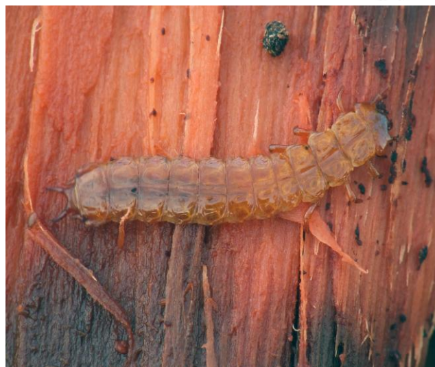
Fig. 5. Cucujus cinnaberinus (Scopoli, 1763) (Cucujidae), larva