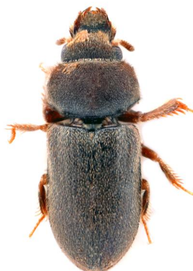
Fig. 2. Augyles marmota (Kiesenwetter, 1850) (Heteroceridae)

Locality: Peste Meseș, 1.5 km NW Tihău, N47.23126°, E023.31700°, pâraul Almașul, sandy bank under road bridge, 190 m, 1m from water, wet/dry sand border, tumuli, floted, 29.IV.2015, GM (No. 158).