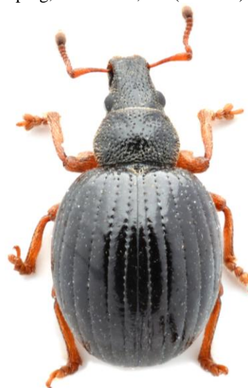
Fig. 9. Mylacomorphus globus (Seidlitz, 1868) (Curculionidae)

Locality: Cliț, 47.284°N, 23.439°E, hornbeam-oak forest, sweeping, 11.V.2015, AP (No. 171).