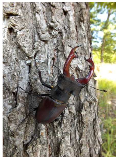
Fig. 1. Lucanus cervus cervus (Linnaeus, 1758) (Lucanidae)

Localities: Aluniș, 47.37144°N, 23.26666°E, oak forest, bottle traps baited with wine, 22.V.2014, GK & CK (No. 47); Aluniș, 47.371°N, 23.267°E, oak-beech forest, 200 m, pitfall trap, 4.VI.2014, GP & ZS (No. 71); SE of Poarta Sălajului, 47.0742°N, 23.20386°E, 320 m, oak forest, soil sample, 1.X.2014, ZB, LD, GK & DM (No. 118).