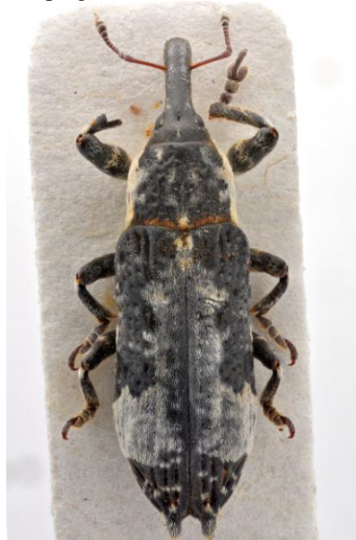
Fig. 8. Lixus cylindrus (Fabricius, 1781) (Curculionidae)

Locality: Aghireș, 47.15716°N, 22.99252°E, dry swards, sweeping, 24.V.2014, CK (No. 52).