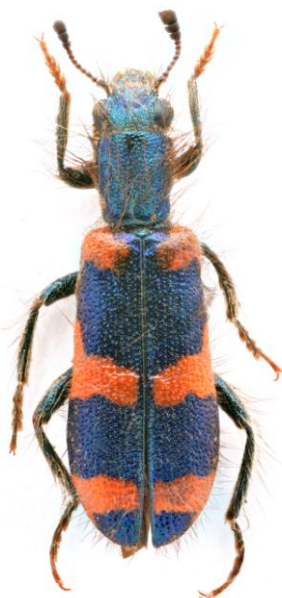
Fig. 3. Trichodes punctatus Fischer von Waldheim, 1829 (Cleridae)