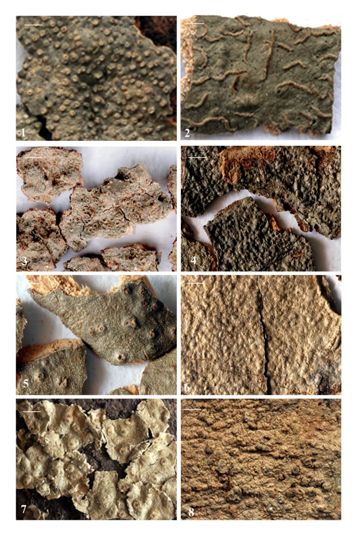
Figs 1–8 – 1 Asteristion alboolivaceum (Vain.) I. Medeiros, Lücking & Lumbsch. 2 Chapsahiata (Hale) Sipman. 3 Diploschistes rampoddensis (Nyl.) Zahlbr. 4 Fissurina rubiginosa (Fée) Staiger. 5 Ocellularia albomaculata Hale. 6 Ocellularia ascidioidea Hale. 7 Ocellularia kanneliyensis Hale. 8 Ocellularia monosporoides (Nyl.) Hale.