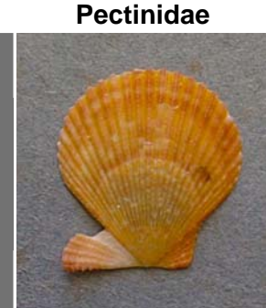
Mimachlamys asperrima (Lamarck, 1819)