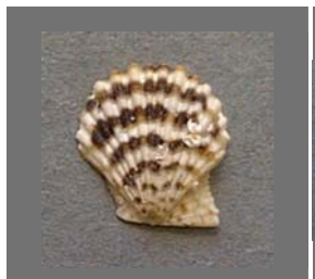
Semipallium coruscans (Hinds, 1845)