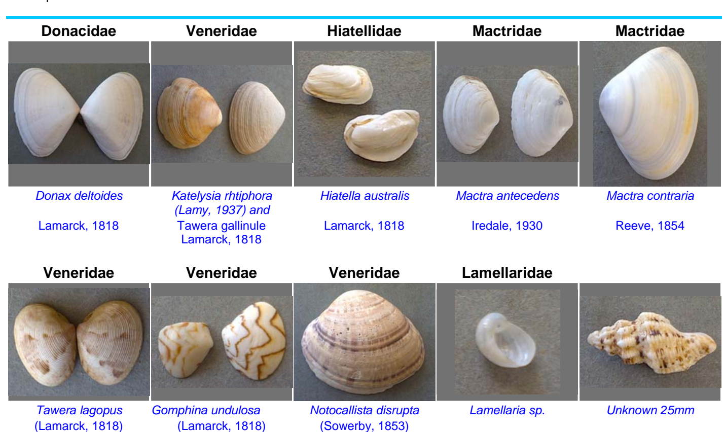
Table 1 The Gastropods

This final part to this series includes the full list of ALL species observed over the 12 month study. A large percentage of the listed species have not been included elsewhere within this series of articles.