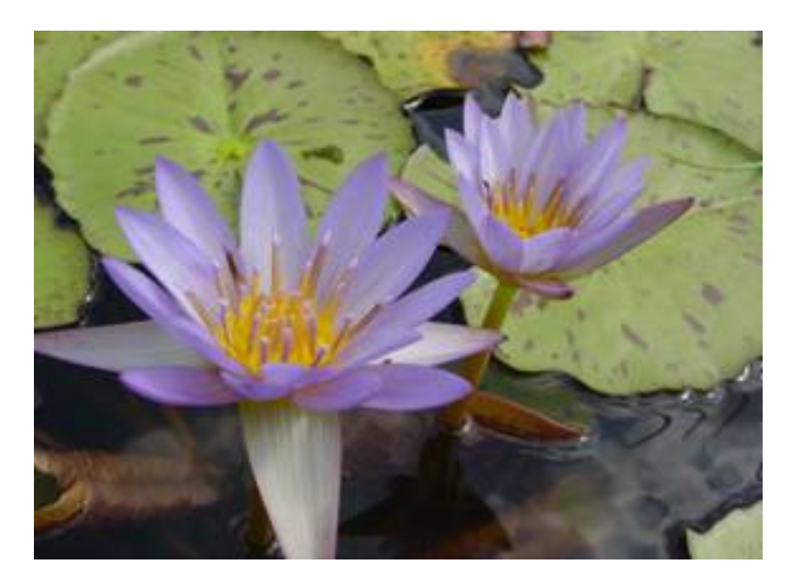
'Bua Phuean' x 'Suthasinobon'