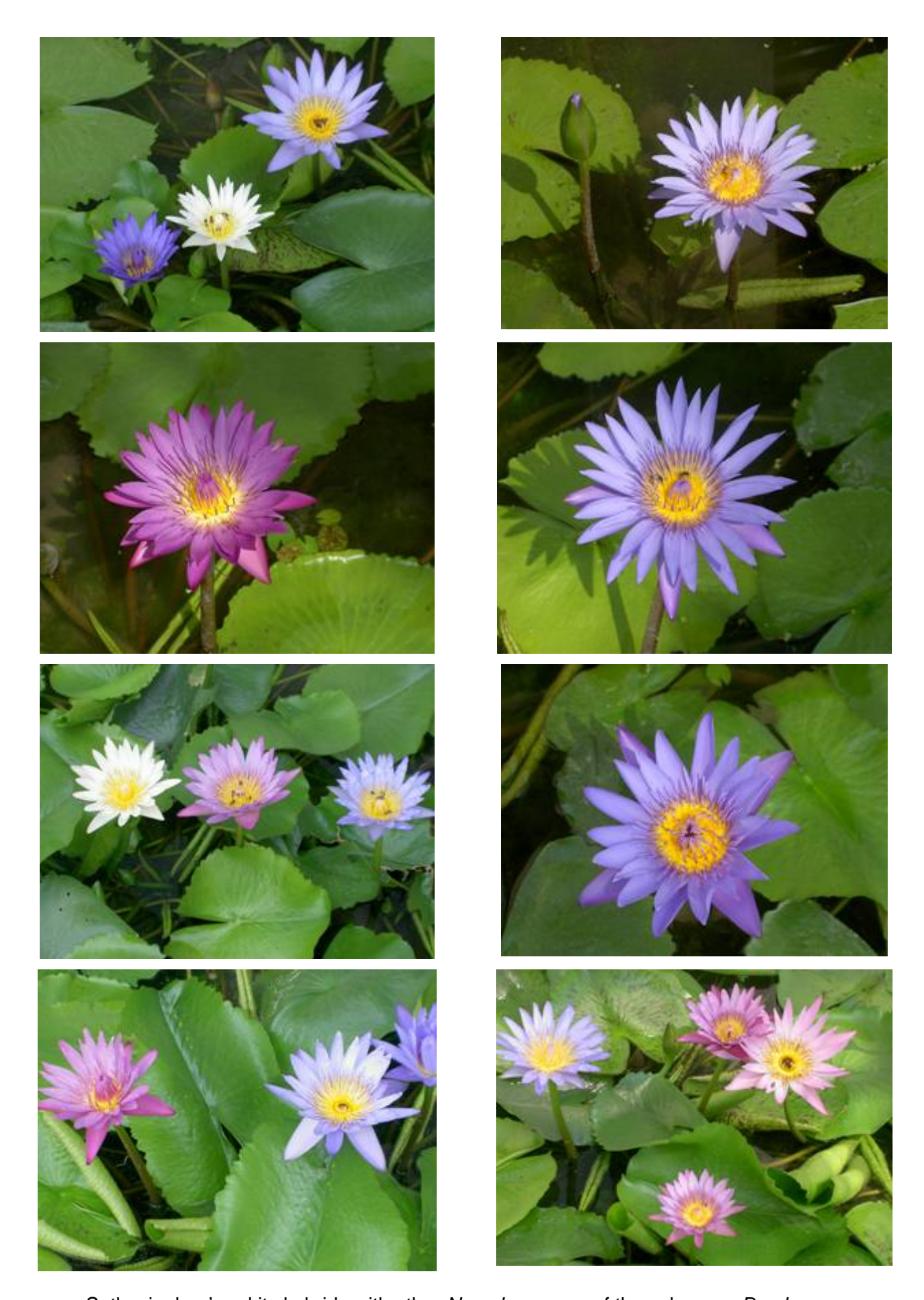
Suthasinobon' and its hybrids with other Nymphaea spp. of the subgenus Brachyceras