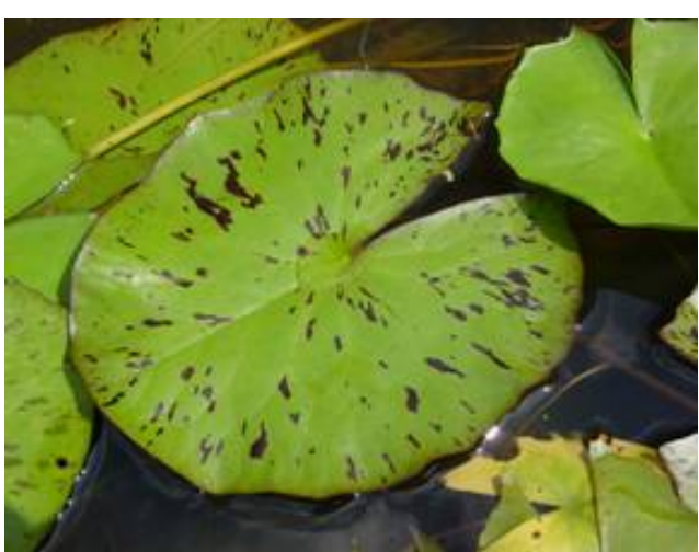
A leaf of 'Bua Phuean' x 'Suthasinobon'