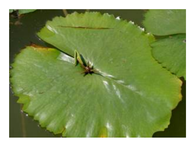
'Suthasinobon' and its hybrids with other Nymphaea spp. of the subgenus Brachyceras