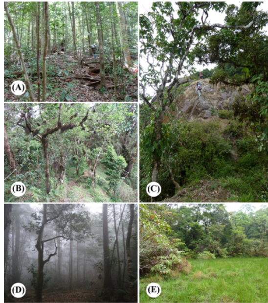
Figure 1. Study area of Khao Soi Dao wildlife sanctuary (A) trail to summit of Khao Soi Dao; (B-D) summit of Khao Soi Dao; (E) Seto swamp.