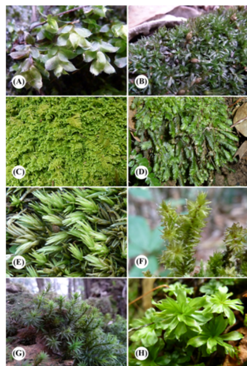
Figure 3. Some mosses found in Khao Soi Dao wildlife sanctuary (A) Calyptrochaeta remotifolia (Müll.Hal.) Z.Iwats., B.C.Tan & Touw; (B) Diphyscium longifolium Griff.; (C) Ectropothecium sikkimense (Renauld & Cardot) Renauld & Cardot; (D) Fissidens nobilis Griff.; (E) Leucobryum juniperoideum (Brid.) Müll.Hal.; (F) Meteorium speciosum (Dozy & Molke.) Mitt.; (G) Pogonatum neesii (Müll.Hal.) Dozy; (H) Rhodobryum roseum (Hedw.) Limpr.