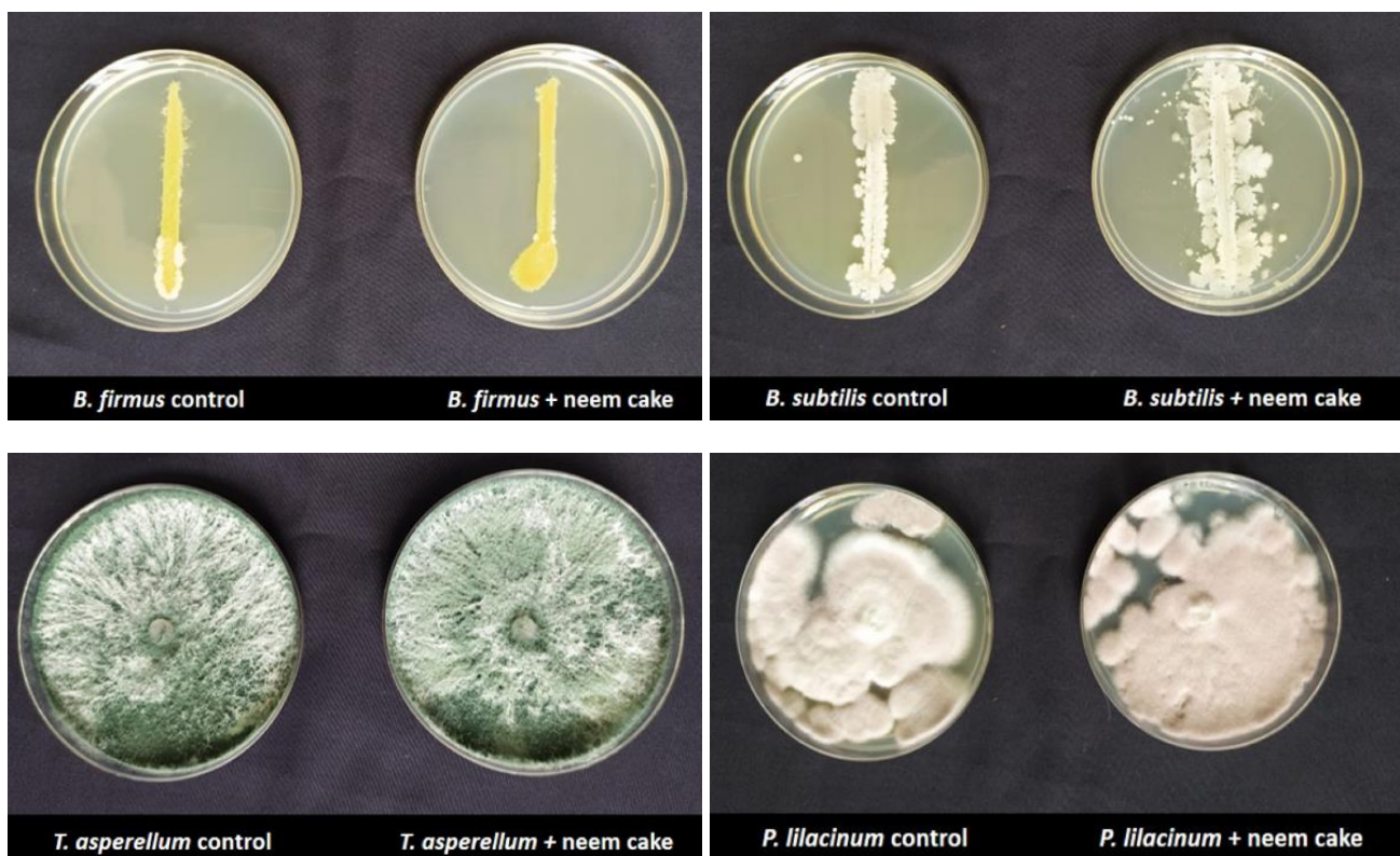
Fig 1: Compatibility studies on different biocontrol agents with neem cake

The results of compatibility studies on different biocontrol agents with neem cake showed that B. firmus , B. subtilis , T. asperellum , P. lilacinum had good growth in plates amended with neem cake. The results stated that all the biocontrol organisms were compatible with neem cake. (Figure 1, Table 1). The present findings were in correlation with Zope et al. (2019) [8]. The neem cake was found to be an excellent carrier material for dispersing the biocontrol agents. T. viride was found to have better shelf life 200 days and 35.7 \times 10^7 CFU per gram and also inhibited the growth of pathogens under in-vitro conditions. The results of Bagwan (2010) [1] also quotes that the biocontrol organisms were found to be compatible with neem cake at different concentrations. The present findings were in correlation with the above findings.