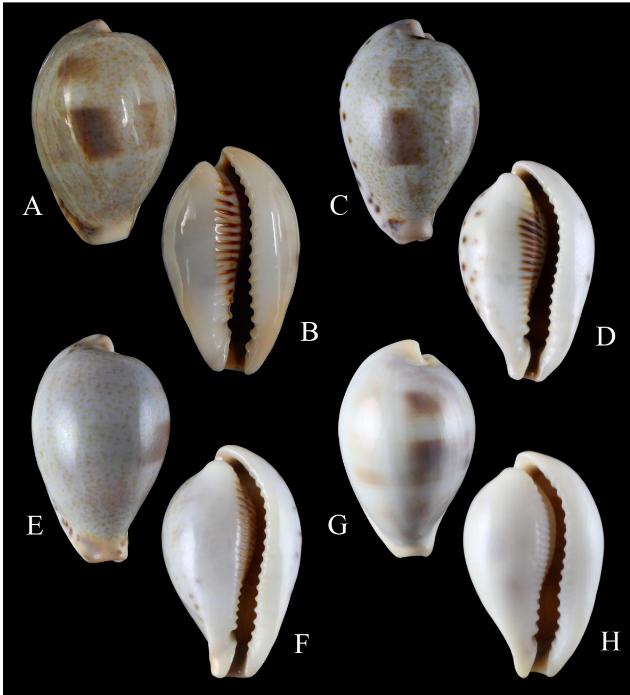
Figure 2. Species of Erronea (Ipserronea) from the western Pacific and eastern Indian Oceans. A, B = Erronea (Ipserronea) smithi (Sowerby, 1881), length 26.3 mm, trawled from 50 m depth off Cape Leveque, Dampier Peninsula, Western Australia; C, D = Erronea (Ipserronea) pyriformis (Gray, 1824), length 31 mm, trawled from 30 m depth off Panglao, Bohol Island, Philippines; E, F = Erronea (Ipserronea) carnicolor (Preston, 1909), length 36 mm, trawled from 40 m depth off Tanum Sands, Queensland, Australia; G, H = Erronea (Ipserronea) angioyorum (Biraghi, 1978), length 27.6 mm, trawled by shrimpers from 80 m depth off Kerala, India.