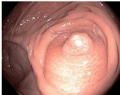
Fig. 1 Colonoscopic view in a 63-year-old woman with abdominal pain but no fever or diarrhea showing the elevated, inflamed appendiceal orifice.