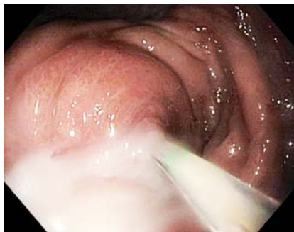
Fig. 2 Profuse discharge of pus from the appendiceal orifice.