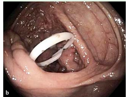
Fig. 4 a, b A 4-cm long, 7-Fr double pigtail catheter placed in the abscess cavity.