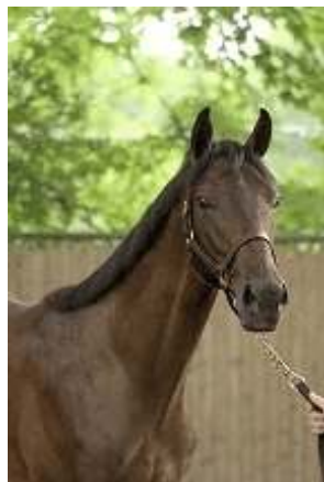
Hip 136

A colt by the Unbridled out of Words of War (Lord at War {Arg}) brought a final bid of $2.7 million to top the second session of Fasig-Tipton's 2003 Saratoga Yearling Sales at the Humphrey S. Finney Pavilion yesterday. Consigned by Stone Farm and Stonerside Stable, with Stone Farm as agent, the bay was purchased by Padua Stables. Words of War, a multiple stakes winner of $683,832, is the dam of E Dubai (Mr. Prospector), a MGSW of $800,800, and Listed winner No Matter What (Nureyev), a $425,000 KEEJUL yearling who captured the GI Del Mar Oaks. The underbidder was