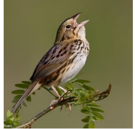
Top to bottom: TWRA Prescribed burn - Clarence Coffey, TWRA (retired); Henslow's Sparrow - Chris Sloan/next page: Eastern Slender Glass Llzard - Chris M. Morris

The flora of the Eastern Highland Rim is highly diverse, and its grasslands support a diversity of rare birds. The topography and hydrology of the barrens support characteristic herbaceous and forested wetland habitats.