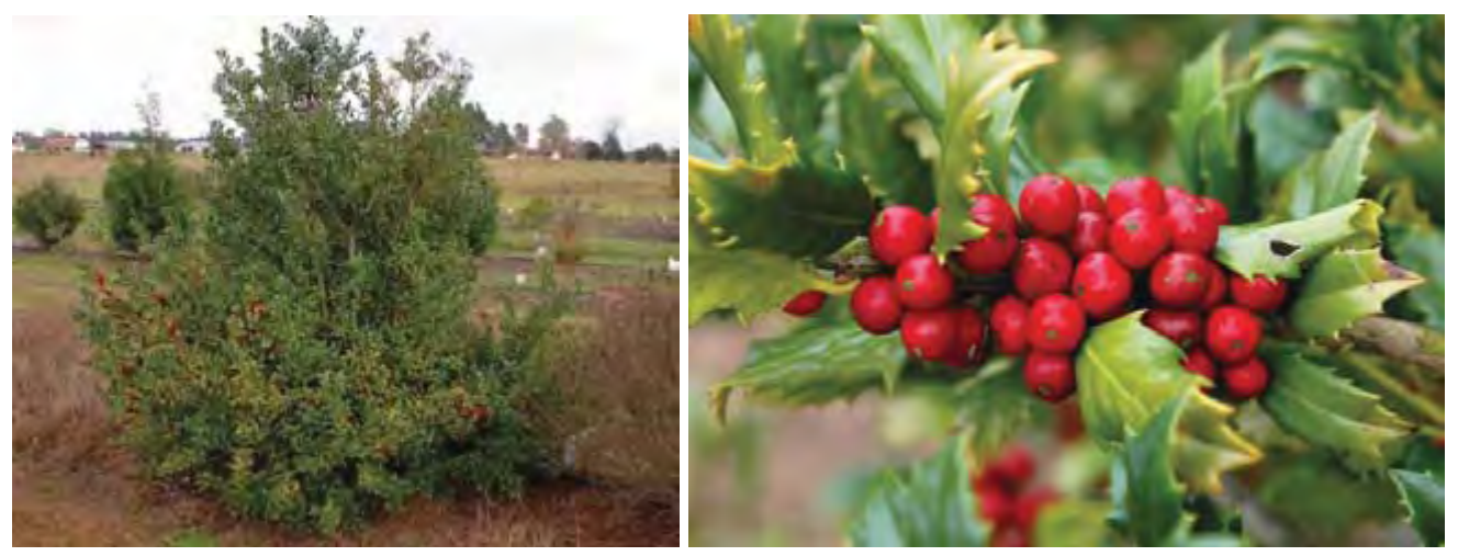
Figure 26. Ilex x Little Red<sup>™</sup>