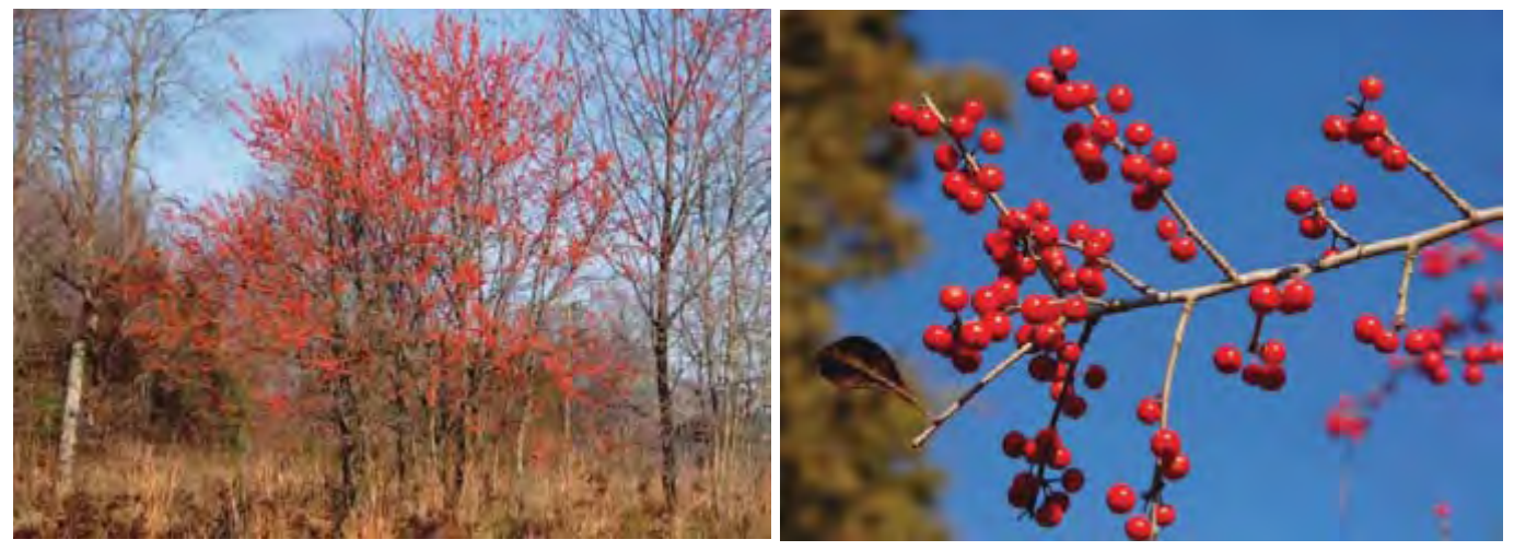
Figure 27. Possumhaw

Possumhaw is one of two deciduous (loses leaves in the winter) hollies native to Arkansas. It would likely be difficult for a home gardener to tell the difference between Possumhaw and Winterberry Holly ( I. verticillata ) as the differences, while real, are subtle. Possumhaw is either a large multi-stemmed shrub or small tree with a height of 20' and spread of 15'. It is reported to be more tolerant of alkaline soils than Winterberry Holly. 'Warren's Red' is an excellent selection.