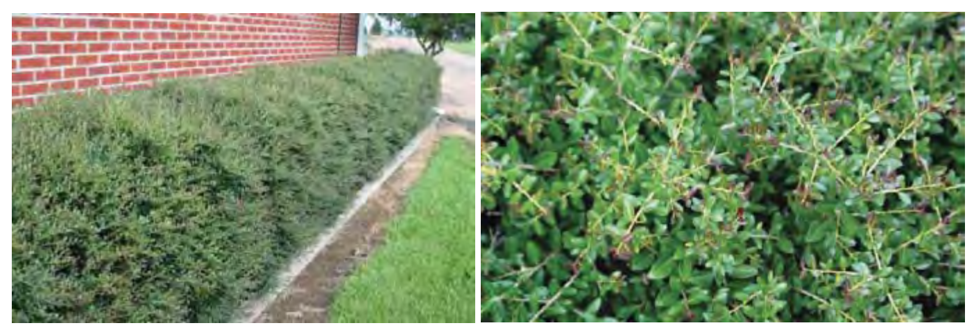
Figure 15. 'Schillings' ('Stokes Dwarf')

'Schillings' is a common dwarf selection sold in the trade. Very similar to Bordeaux<sup>™</sup> except in leaf color. Selection from Sam Stokes Nursery in LeCompte, Louisiana. Synonymous with 'Stokes Dwarf'. Male.