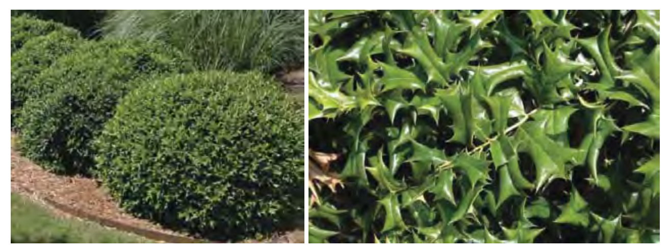
Figure 5. 'Rotunda'

Similar in plant habit to 'Carissa'; however, the leaves of 'Rotunda' are dramatically different. Leaves on 'Rotunda' have, on average, 7 pronounced spines on the leaf margin. This plant should be avoided in areas where children play and should not be located near sidewalks. Similar to 'Carissa', although a female selection, the fruit production is variable.