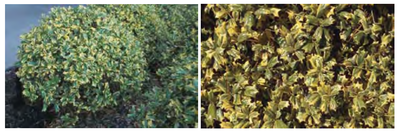
Figure 4. 'O. Spring'

This male seedling was found by Otto Spring, a nurseryman in Oklahoma. It is unique in that the margin of the leaves has an irregular band of yellow on what are otherwise dark green, lustrous leaves.