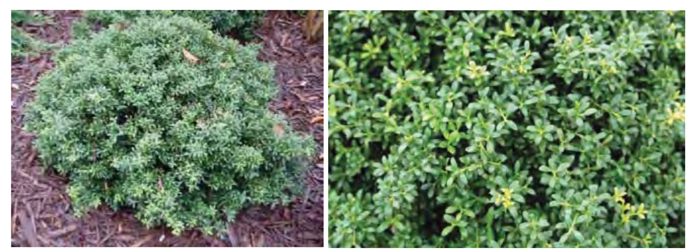
Figure 9. 'Soft Touch'

'Soft Touch' is commonly sold in Arkansas and appears to have more heat tolerance than most Japanese hollies. The branches are not as stiff ('soft touch') as other selections. Female.