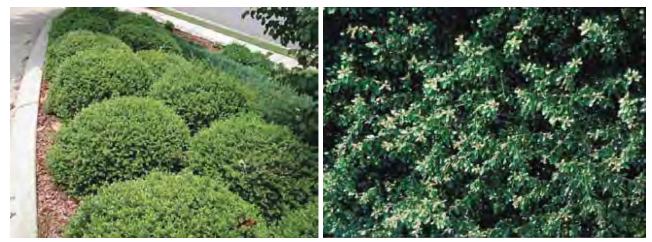
Figure 6. 'Compacta'

'Compacta' is likely a catch-all name for a group of compact, globe-shaped plants.