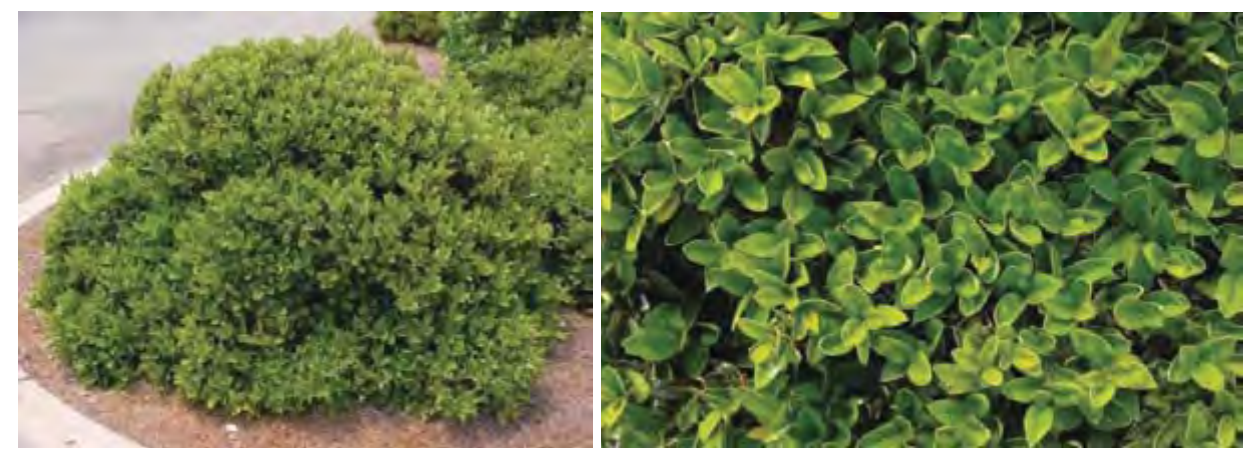
Figure 2. 'Carissa'

A unique, globe-shaped plant that lacks the formidable spines on the margin of the leaf common to most Chinese hollies. The absence of spines along the leaf edge and the plant shape make this an excellent choice along walks or as a foundation plant. Although a female selection, the amount of fruit production is variable.