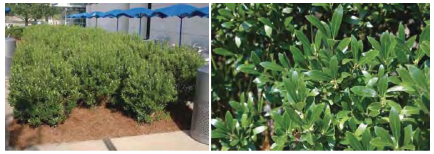
Figure 10. Inkberry Holly

Used less frequently in Arkansas when compared to the selections of Japanese and Chinese holly. Similar to Japanese holly, the fruits are black. In general, the plant habit is an upright oval. The most common complaint about this evergreen holly is the fact that the lower leaves tend to drop, leaving bare branches at the base of the plant. A number of selections (e.g., 'Nigra') have better leaf retention at the base. This holly should be used more in Arkansas as a foundation plant or in masses.