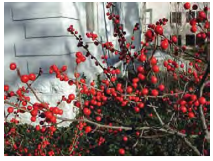
Figure 29. 'Sparkleberry'