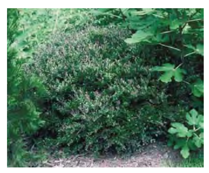
Figure 13. Bordeaux™

Bordeaux<sup>TM</sup> is a fairly distinctive selection with the new leaves having a burgundy tinge and the overall leaf color in the winter being a darker green-burgundy than most Yaupon cultivars. This is a branch sport of 'Schillings'. The primary difference between the two is the burgundy hues found in Bordeaux<sup>TM</sup>. Commonly used as a foundation plant or in masses. Male.