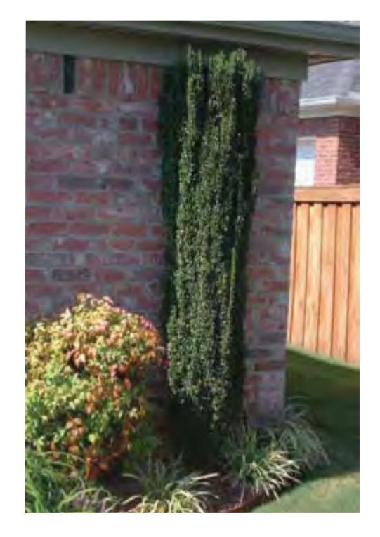
Figure 16. 'Will Fleming'

'Scarlet's Peak' is another columnar (20' x 3') selection.