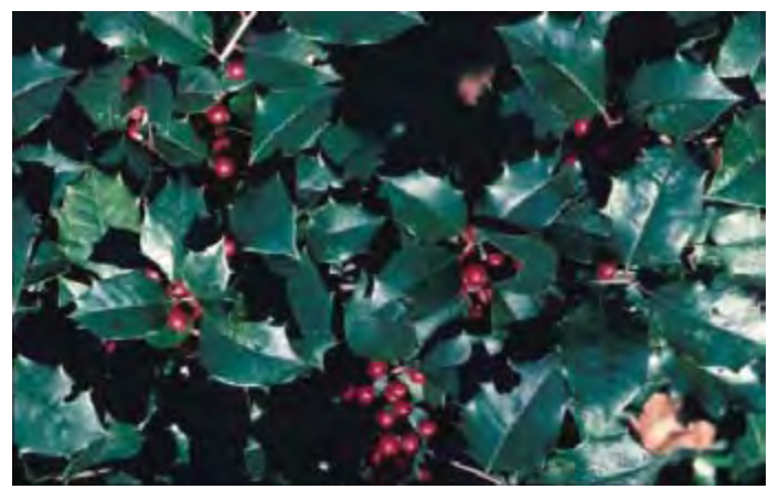
Figure 11. American Holly

American holly is another holly native to the U.S. ( I. vomitoria ; I. glabra ) and is often found in woodland settings of the Southeast. This holly is used less often in modern landscapes mainly due to the slower growth when compared to many of the newer holly hybrids. Avoid seed-grown American holly because there are too many excellent cultivars (e.g., 'Carolina #2', 'Jersey Princess', 'Old Heavy Berry') in the trade with superior fruit and plant habit characteristics.