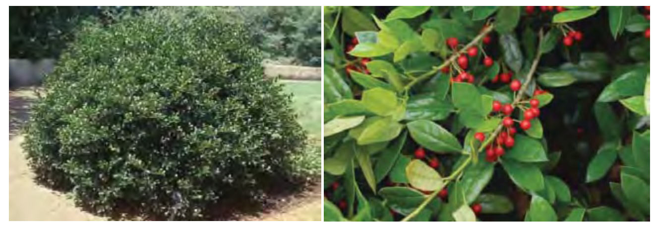
Figure 3. 'Dwarf Burford'

The dwarf Burford is nearly a globe-shaped plant. Leaves, which are dark green, are almost puckered in appearance with a single spine at the leaf tip. Fruit production is moderate.