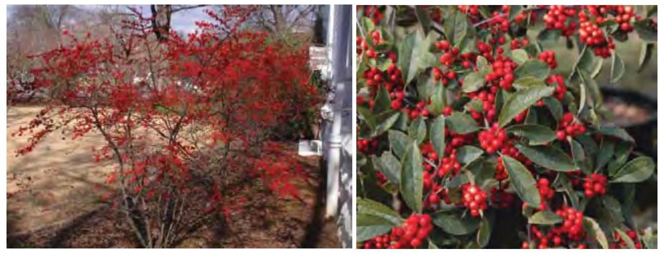
Figure 28. 'Afterglow'

The Winterberry Holly is generally smaller in size (8' tall x 10' wide) than Possumhaw. There are many more (30 to 40) selections of Winterberry Holly than Possumhaw. Fruits on either of these deciduous hollies is exceptional and adds a great deal to a winter landscape. There are many cultivars including 'Afterglow', 'Cacapon', 'La Have', 'Red Sprite' and Winter Red<sup>R</sup>.