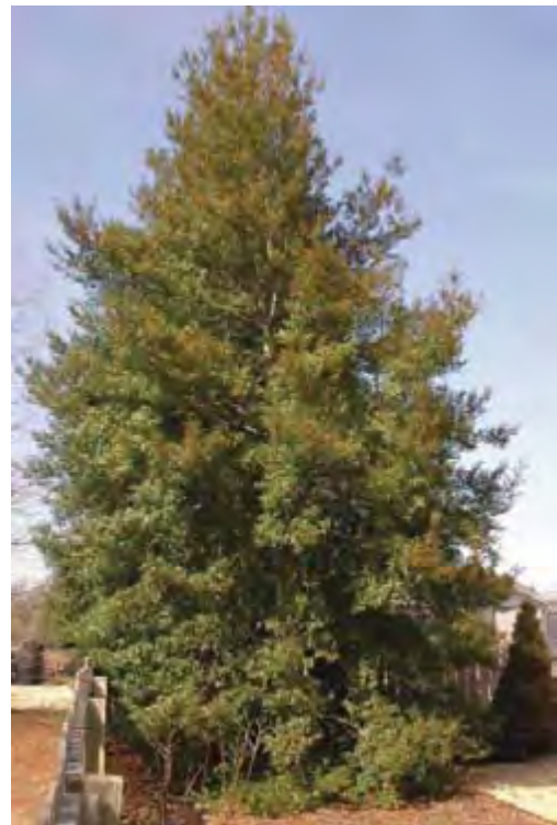
Figure 17. 'Foster #2'