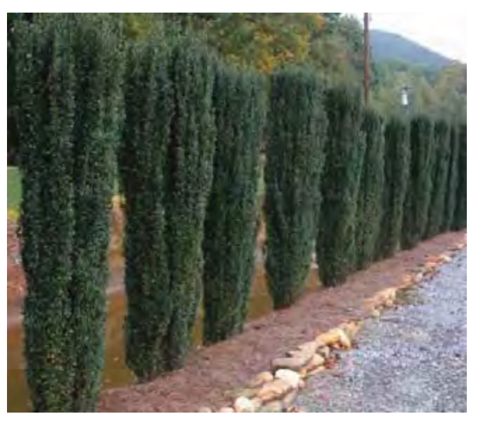
Figure 8. 'Sky Pencil'

'Sky Pencil' is a very distinctive, upright columnar-shaped plant. Useful in narrow spaces or as a low, narrow hedge. 'Sky Pencil' was introduced by the U.S. National Arboretum in 1992. The plant was discovered in the wild on Mount Daisen, near Honshu, Japan.