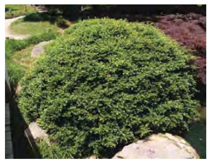
Figure 7. 'Helleri'

A dwarf, mounded form with a distinctive, layered habit.