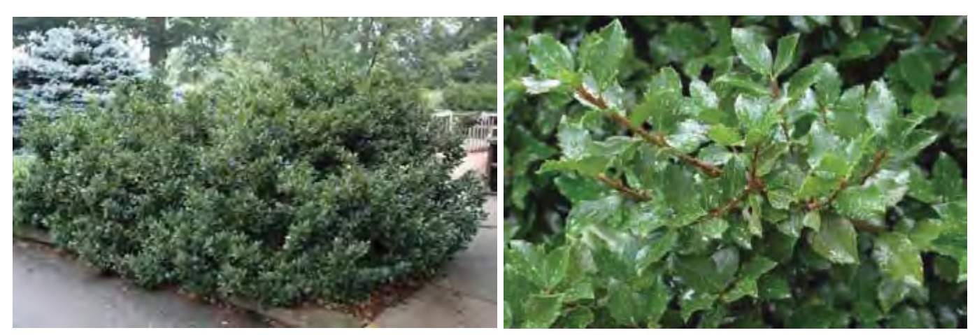
Figure 25. Ilex x meserveae 'Blue Stallion'