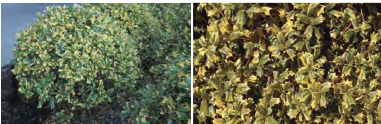
Figure 4. 'O. Spring'

This male seedling was found by Otto Spring, a nurseryman in Oklahoma. It is unique in that the margin of the leaves has an irregular band of yellow on what are otherwise dark green, lustrous leaves.