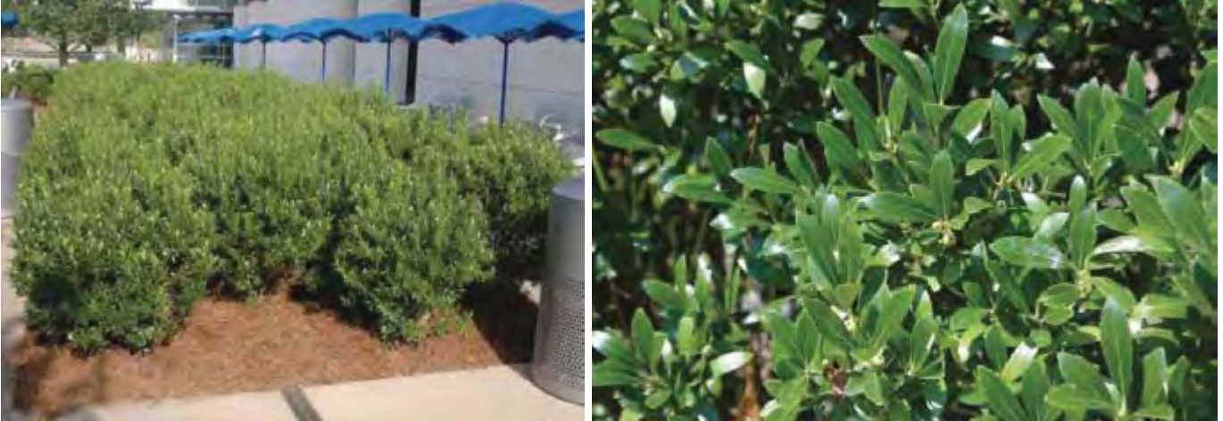
Figure 10. Inkberry Holly

Used less frequently in Arkansas when compared to the selections of Japanese and Chinese holly. Similar to Japanese holly, the fruits are black. In general, the plant habit is an upright oval. The most common complaint about this evergreen holly is the fact that the lower leaves tend to drop, leaving bare branches at the base of the plant. A number of selections (e.g., 'Nigra') have better leaf retention at the base. This holly should be used more in Arkansas as a foundation plant or in masses.