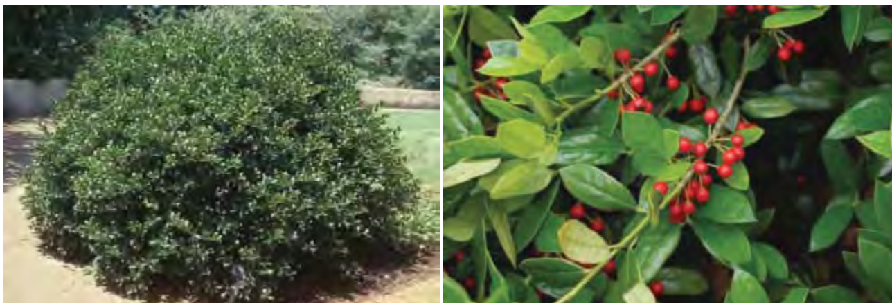
Figure 3. 'Dwarf Burford'

The dwarf Burford is nearly a globe-shaped plant. Leaves, which are dark green, are almost puckered in appearance with a single spine at the leaf tip. Fruit production is moderate.