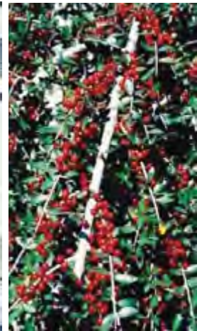
Figure 14. 'Pendula'