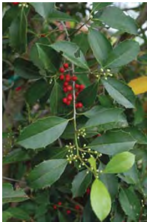
Figure 19. ‘Savannah’

‘Savannah’ is a very common form in the Southeast. Leaves have more spines in comparison to ‘East Palatka’. Fruit production is excellent. The parent plant was found in Savannah, Georgia.