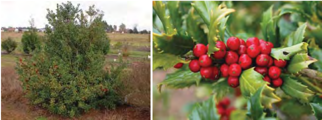
Figure 26. Ilex x Little Red ™