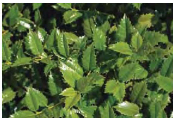
Figure 22. 'Mary Nell'