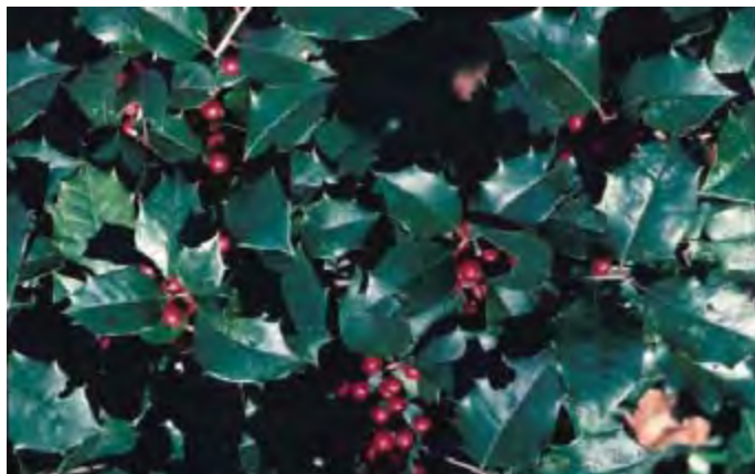
Figure 11. American Holly