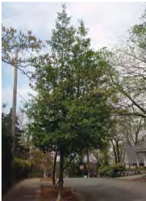
Figure 18. ‘East Palatka’

‘East Palatka’ is a very popular cultivar in the trade. While pyramidal in shape, it is not as tight as ‘Foster #2’. Less cold hardy than ‘Foster #2’ and ‘Savannah’. Female.