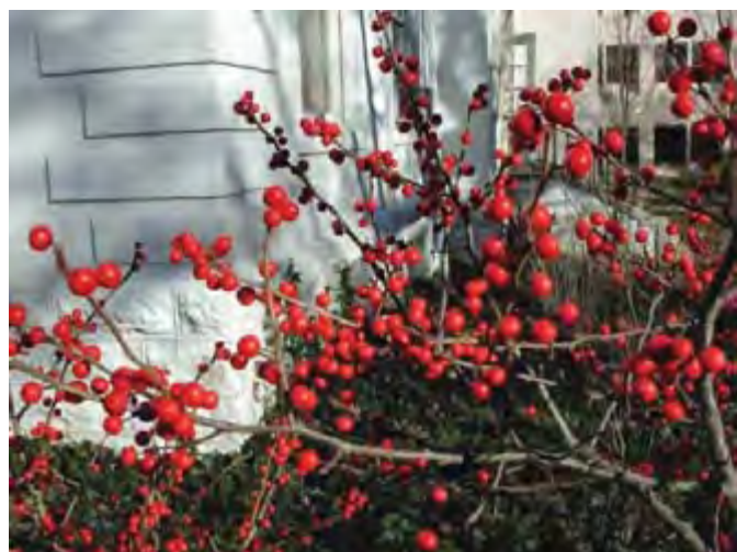
Figure 29. 'Sparkleberry'