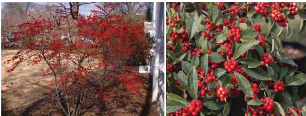
Figure 28. 'Afterglow'

The Winterberry Holly is generally smaller in size (8' tall x 10' wide) than Possumhaw. There are many more (30 to 40) selections of Winterberry Holly than Possumhaw. Fruits on either of these deciduous hollies is exceptional and adds a great deal to a winter landscape. There are many cultivars including 'Afterglow', 'Cacapon', 'La Have', 'Red Sprite' and Winter Red ® .