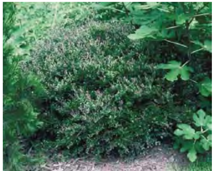
Figure 13. Bordeaux™

Bordeaux™ is a fairly distinctive selection with the new leaves having a burgundy tinge and the overall leaf color in the winter being a darker green-burgundy than most Yaupon cultivars. This is a branch sport of 'Schillings'. The primary difference between the two is the burgundy hues found in Bordeaux™. Commonly used as a foundation plant or in masses. Male.