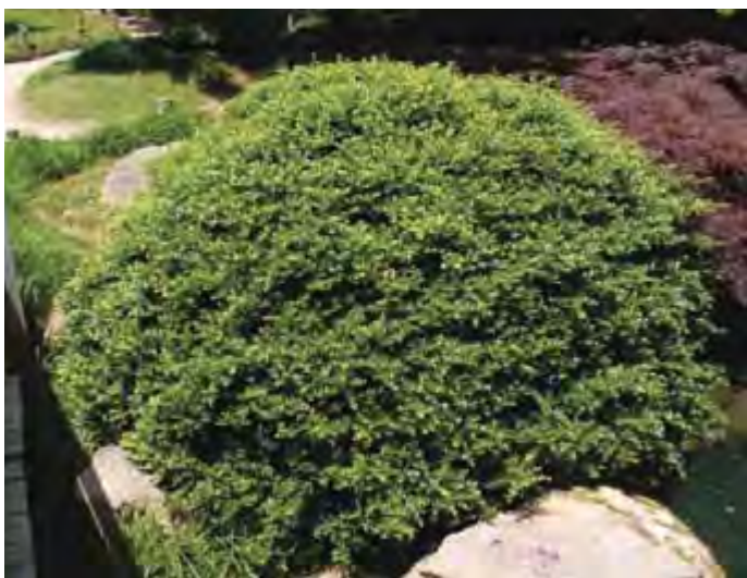
Figure 7. 'Helleri'

A dwarf, mounded form with a distinctive, layered habit.