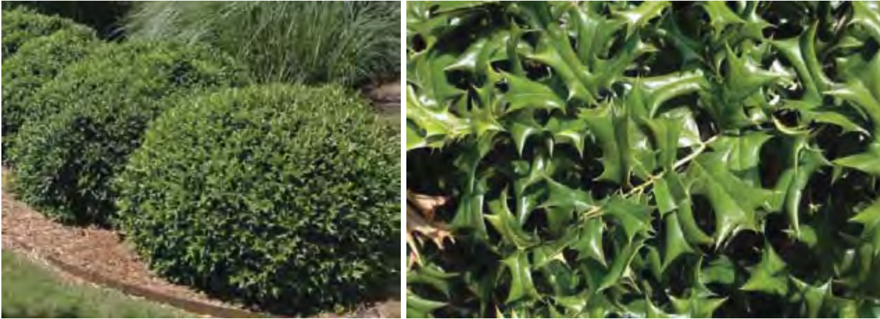
Figure 5. 'Rotunda'

Similar in plant habit to 'Carissa'; however, the leaves of 'Rotunda' are dramatically different. Leaves on 'Rotunda' have, on average, 7 pronounced spines on the leaf margin. This plant should be avoided in areas where children play and should not be located near sidewalks. Similar to 'Carissa', although a female selection, the fruit production is variable.