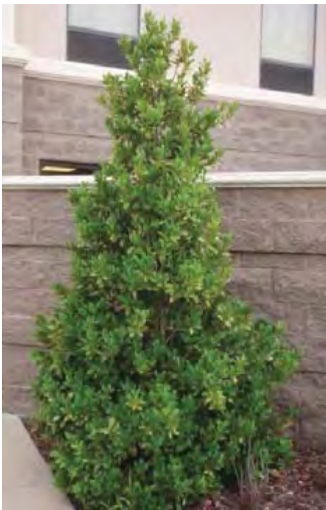
Figure 24. Ilex x Oakland ™

In addition to the hollies described so far, there are many other excellent holly selections sold in Arkansas. One of these is the Dixie series, a series of hybrid hollies from Plant Development Services (PDSI) in Loxley, Alabama. Specific cultivars in this series include Dixie Dream™ and Dixie Flame™. Dixie Dream™ was evaluated by the University of Arkansas Plant Evaluation Program from 1999 to 2003. Average plant size statewide was 8.5' tall by 5.5' wide. Plants have an upright pyramidal shape without pruning and a finer