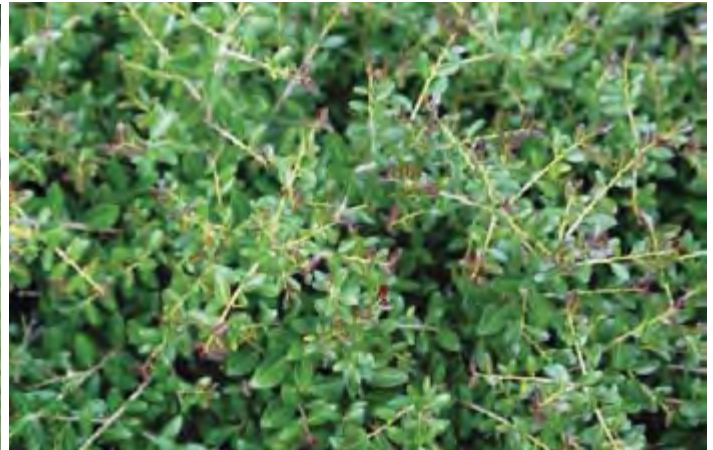
Figure 15. 'Schillings' ('Stokes Dwarf')