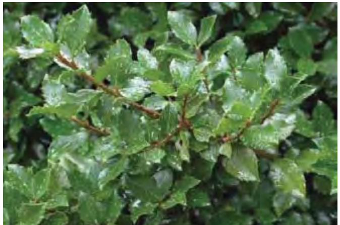
Figure 25. Ilex x meserveae 'Blue Stallion'