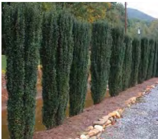
Figure 8. 'Sky Pencil'

'Sky Pencil' is a very distinctive, upright columnar-shaped plant. Useful in narrow spaces or as a low, narrow hedge. 'Sky Pencil' was introduced by the U.S. National Arboretum in 1992. The plant was discovered in the wild on Mount Daisen, near Honshu, Japan.