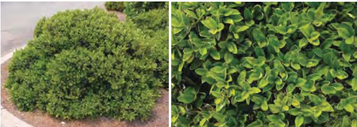
Figure 2. 'Carissa'

A unique, globe-shaped plant that lacks the formidable spines on the margin of the leaf common to most Chinese hollies. The absence of spines along the leaf edge and the plant shape make this an excellent choice along walks or as a foundation plant. Although a female selection, the amount of fruit production is variable.