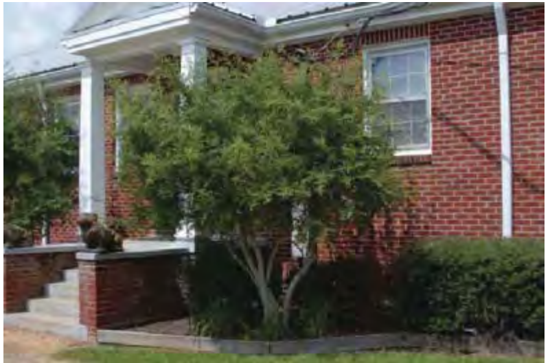
Figure 12. Yaupon Holly

This small-leaved holly is native to the southeastern U.S., extending into the southernmost counties of Arkansas. At first glance the Yaupon holly looks very similar to the Japanese holly. The two are easily separated by leaf and fruit characteristics. The most obvious difference is the fruit color. Fruits on Yaupon are red while those on the Japanese holly are black. New leaves on Yaupon tend to have a purple tinge to the green leaves, whereas the new leaves on Japanese holly are typically a medium green. Outermost stems on the Yaupon holly are distinctly gray in contrast to the yellow-green color of young stems on the Japanese holly. In general, Yaupon holly performs better in central and south Arkansas (zones 7 and 8) than Japanese holly.