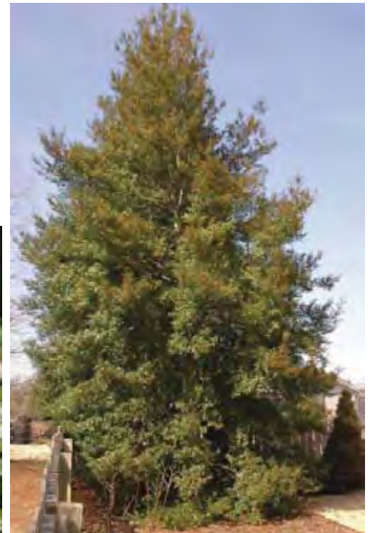
Figure 17. 'Foster #2'