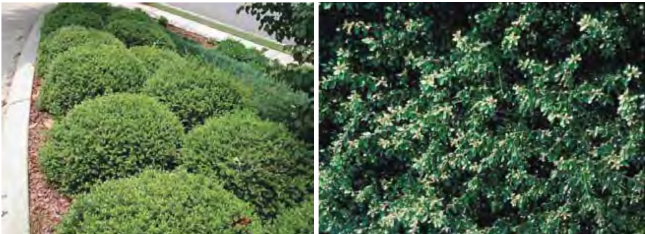
Figure 6. 'Compacta'

'Compacta' is likely a catch-all name for a group of compact, globe-shaped plants.