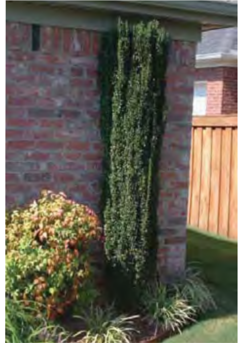
Figure 16. 'Will Fleming'

'Will Fleming' has a distinctly narrow, upright form. The plant tends to splay as it ages, which may cause some maintenance issues. Male?