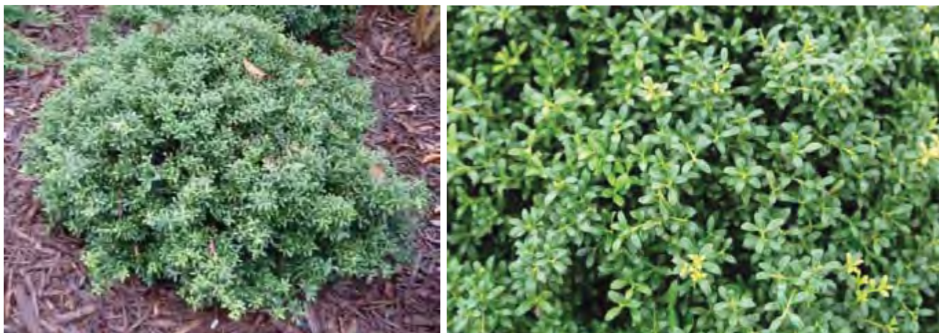
Figure 9. 'Soft Touch'

'Soft Touch' is commonly sold in Arkansas and appears to have more heat tolerance than most Japanese hollies. The branches are not as stiff ('soft touch') as other selections. Female.